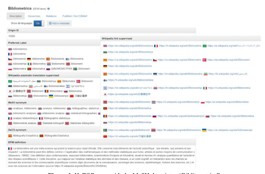
Figure 1. HeTOP page with the MeSH descriptor "Bibliometrics" (also available at: https://www.hetop.eu/hetop/en/#rr=MSH D 015706&q=bibliometrics)

To disseminate MIMO, the MIMO team has chosen HeTOP, which is a crosslingual multiterminogy server (URL: https://www.hetop.eu/hetop/en) [12]. HeTOP contains more than 2 million concepts in English, 100 health terminologies, and ontologies, 55 languages, including non-European languages (e.g., Arabic, Hebrew, Japanese, Korean or Mandarin). Moreover, the generic model of HeTOP is compatible with the ISO 25964 standard and allows interoperability with other vocabularies platforms [13,14]. Termino-ontologies are regularly updated and are accessible via a website and a dedicated web service. HeTOP has been designed as a reference multi-terminology and multilingual server to help librarians, translators, students, and medical professionals retrieve resources and knowledge across various complex medical fields. In France, HeTOP is also largely used by the French Agency of Digital Health to populate and update the national terminology server to disseminate the main reference terminologies. The proof-of-concept of the MIMO was integrated, in mid-2019, into the HeTOP terminology server and was available to the consortium using an identification. Since the beginning of 2022, MIMO is freely available via HeTOP.