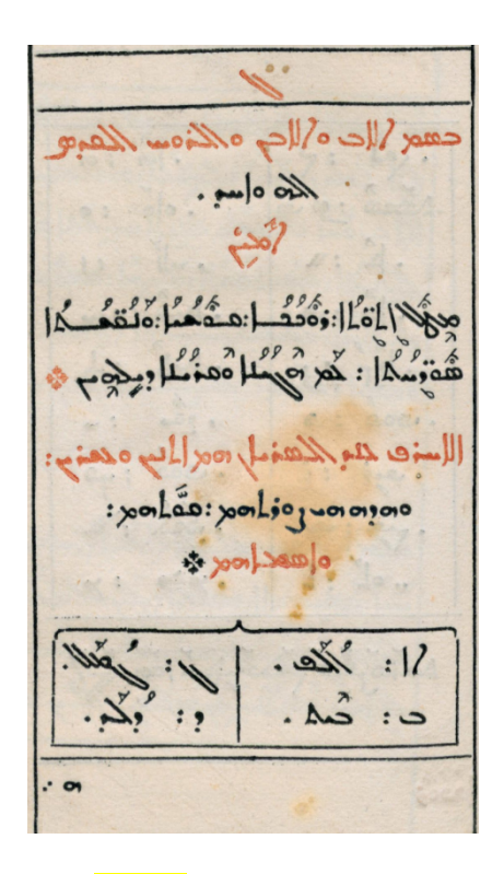
Fig. 6: BML Or. 459, f. 534r Alphabetum chaldaicum , Rome, 1592. Courtesy of the Italian Ministry of Culture – Further reproduction by any means is prohibited.