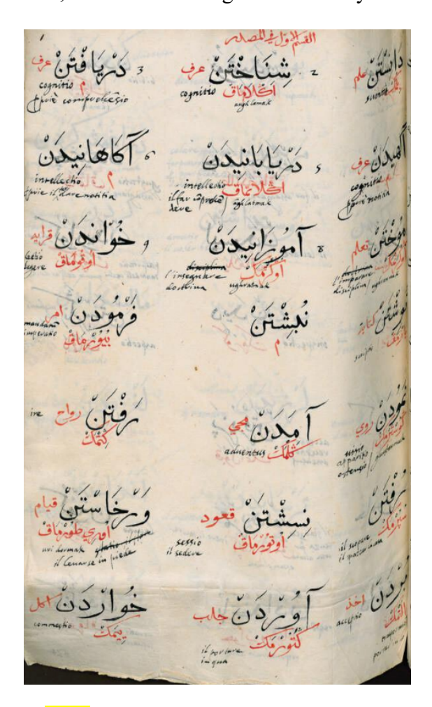
Fig. 4: BML Or. 455/2, f. 156r Persian lexicon with Arabic, Turkish and Latin translation in Raimondi's hand. Courtesy of the Italian Ministry of Culture – Further reproduction by any means is prohibited.

In addition to the development of these personal linguistic tools, Raimondi also collected native lexicographical works and bilingual dictionaries in Oriental languages, which he copied and used as starting points for his study and publishing projects; to these copies (and only seldom to the texts in the original codices), multiple translations in Italian/Latin were provided, sometimes with the addition of translations in other Oriental languages. In some rarer but very interesting cases the lemmata were displayed in clusters grouping a lexical entry, e.g. a Persian word, written in black ink and in larger writing, two translations into, say, Arabic and Turkish, in red ink and smaller writing, placed beside the lemma and below the line, respectively, and an Italian/Latin translation in black ink and small writing, placed somewhere between the two red-ink translations. This is the case, for example, in BML Or. 455/2, containing a Persian lexicon with Arabic, Turkish and Latin translations. Here the Persian entries are organized approximately into three columns, a few centimeters distant from one another, each lemma being surrounded by its various translations (fig. 4).