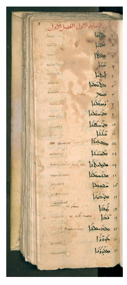
Fig. 5a, b: a) BML Or. 126, f. 2v Kitāb al-tarǧumān (XII sec.) Arabic-Syriac lexicon copied in the half of the 16<sup>th</sup> c., and b) BNCF II.III.14, f.1r Syriac-Latin lexicon extracted by Raimondi.

These lexicographical tools were conceived to be compiled and extended over time; this is evidenced by the numerous folios which remained blank in many of them, and by the annotations of the original sources in some cases. For this, Raimondi took advantage of his ongoing learning process of the different Oriental languages, the native source he continued to collect, as well as, possibly, the oral collaboration of his informants. The final products became part of his learning equipment, but he was also aiming at the production of specific lexica for each language to be attached to the main and most challenging project of the TM, namely that of the Polyglot Bible. Nonetheless, the editorial activity was not the only driving element: Raimondi's language learning and textual study was an integrated system in which every phase was connected to the other to build up a coordinate network of references;<sup>37</sup> this method was adopted to improve his linguistic, semantic, and textual universe, adding to his mother tongue and to Latin, the Oriental languages attested in the sources at his disposal, in order to outline and characterize the cultural and intellectual background they conveyed via their original words and expressions.