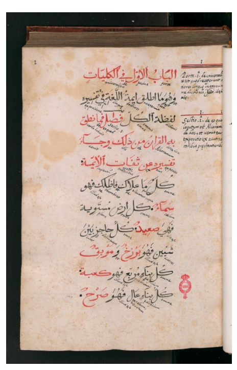
Fig. 1a, b: a) Raimondi's first copy of the Arabic work Fiqh al-luġa wa-sirr al-ʿarabiyya, by al-Ṭaʿālibī, with Italian translation dated 5 May – 12 Nov. 1592 (BNCF, Magl. Cl. III.62, f. 24v) and b) copy for the edition (BNCF, Naz. II.I.6, f. 1r). Note the red numbers on the first copy referring to the page number of the exemplum for the edition.

As already mentioned, Raimondi's intermediate copies of the original texts were always part of his study process, thus their mise en page , usually display interlinear space to add the textual translation, and/or wide margins to add annotations or line numbers, as in the case above. In the final manuscript copies he often made use of rubrications for titles or chapters, and for highlighting specific words, such as the different lemmata in the dictionaries and lexicographical works: this feature was reproduced also in the printed editions of K. al- K\bar{a}fiya , by Ibn al- H\bar{a}gib , and M. al- A\bar{g}urr\bar{u}miyya , by Muḥammad b. D\bar{a}w\bar{u}d al- Sanh\bar{a}g\bar{i} (both published in 1592).