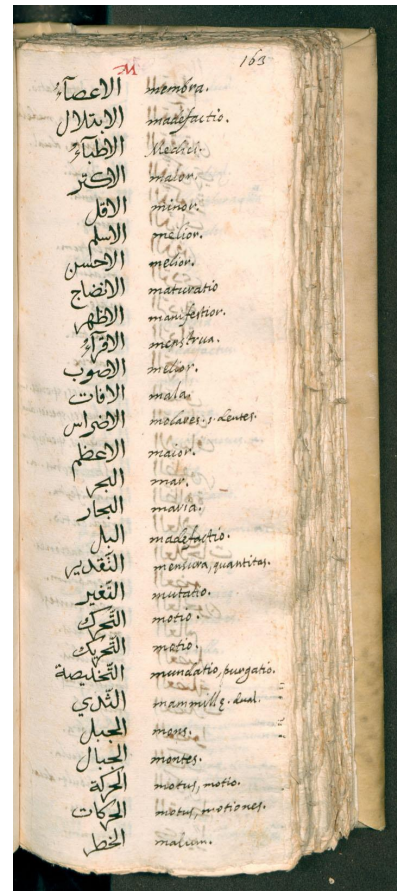
Fig. 3a: BNCF II.III.10, f. 13r Lexicon from Qavānīn-i furs Laʾālī; note the number references of the first four entries to the copy BNCF, Naz. II.I.6 in fig. 1. Courtesy of the Italian Ministry of Culture – Further reproduction by any means is prohibited.

Fig. 3b and c: BNCF II.III.6, f. 81r and BNCF II.III.7, f. 163r Arabic-Latin and Latin-Arabic lexica extrapolated from the Canon of Avicenna (published in 1593).