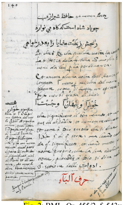
Fig. 2: BML, Or. 455/2, f. 543v Translation of the Qavānīn-i furs by Laʾālī with mention of the collaborators on the lower margin. Courtesy of the Italian Ministry of Culture – Further reproduction by any means is prohibited.

represented by the mention of the collaborators on the manuscript itself, by a change of hand, or by documentary material related to that specific translating endeavor. The first case is exemplified by the translation of the Persian grammar and vocabulary Qavānīn-i furs by the Turkish scholar Sayyid Aḥmad b. Muṣṭafā, known as Laʾālī: the original manuscript from which Raimondi copied the text is BML, Or. 332, an autograph dated 985/1577. In 1585 he drafted a copy with an Italian translation in blocks of text and marginal annotations; among these is also the explicit acknowledgement of his collaborators, namely Paolo Orsino and Tommaso da Terracina (see fig. 2).<sup>29</sup>