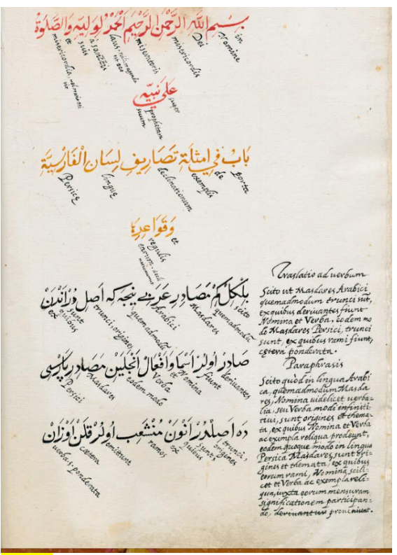
Fig. 8: BML Or. 460 f. 47v Draft of Persian grammar by G.B. Raimondi.

Although we do not have a complete Arabic grammar by Raimondi, we can use some notes and drafts of his to draw a comparison between his approach to language learning and description and that of his fellow scholars, especially Terracina. A manuscript contained in ASFi Misc. Med. 720 ff. 12v-1r contains an incomplete draft by the hand of Raimondi of an Arabic grammar in Latin, beginning with a description of the vowel-signs, diacritics and of some orthographic rules, introducing the relative Arabic grammatical terminology, a description of the parts of speech and a definition of the verb and of some of its morphological features, followed by a series of examples of morphological analysis of verbal forms, according to Arabic grammatical practice. Although written in Latin, the text is clearly inspired by Arabic linguistic theory and the fact that some topics are addressed twice, with a second explanation introduced by the heading Aliter ("otherwise", f. 6r) suggests that Raimondi was in fact comparing different sources. I will focus on the paragraph introducing the parts of speech (ff. 10r-8v), by analyzing it and comparing it to the section on the same topic in Terracina's Turkish grammar.