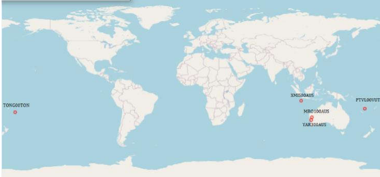
Figure 1. The Geographic Locations of the used IGS Stations

The obtained data were then post-processed using the PPPH software to determine the obtainable positional accuracy using these multi-constellation permanent GNSS sites.