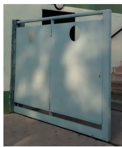
Figure 4 bis – Voluntary erasure (After)

Some are "cleaned up" because situated on sensitive props, such as the entrance door of a University, symbol of the institution itself (fig. 4 and 4 bis).