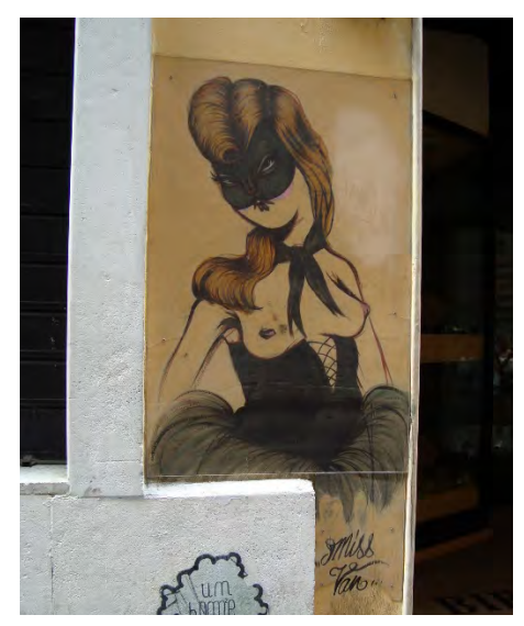
Untitled, paint on wall and plexiglass, ca 110x90, Rome (Italy), 2014