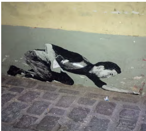
Untitled, paper on wall, ca 130x80, Paris (France), December 2013