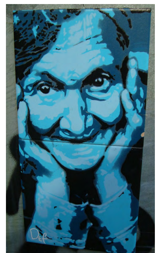
Figure 16 bis - Re-enchanting the experience of the city (piece)