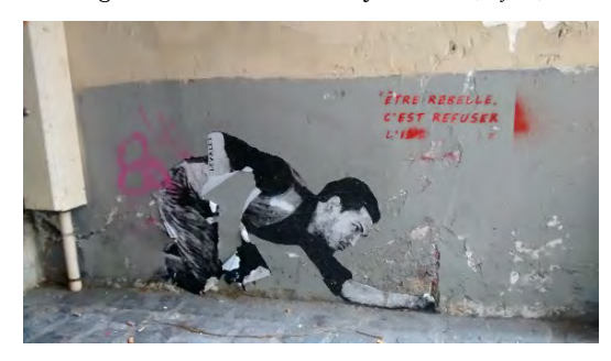
Untitled, paper on wall, ca 130x80, Paris (France), April 2014