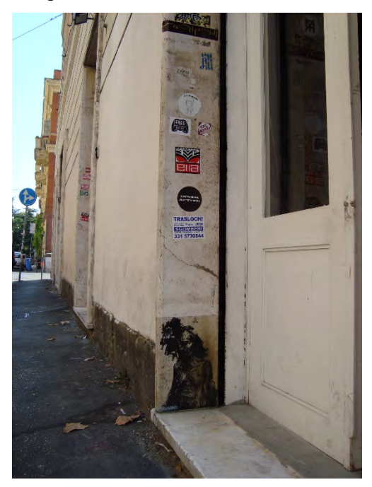
Figure 12 bis – Size and location (context)