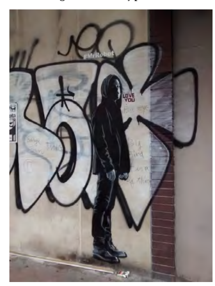
Figure 15 – Self-portrait