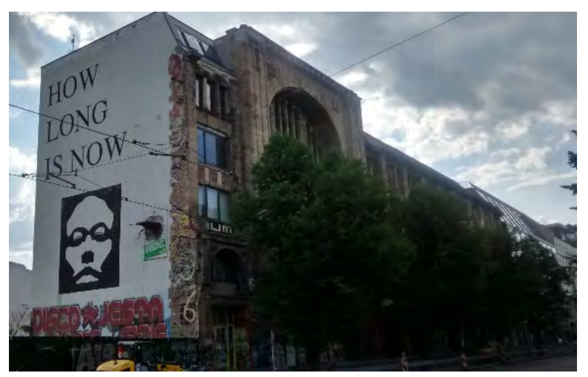
Untitled, paint on wall, ca 1000x500, Berlin (Germany), 2014

Moreover, Street Art works often represent self-portraits, which fight against death and oblivion: «Se peindre, c'est affirmer une présence hic et nunc [...]. Présent pour être reconnu toujours par la postérité. Hic et nunc et semper» –painting oneself is stating a presence hic et nunc , here, now, and forever– (Bonafoux, 2004, p. 24, 28). Graffiti Writing and Street Art are full of self-portraits, either with tags (that are signatures), hoodies (alter egos of Graffiti and Street Artists, like on fig. 15), or assertions of presence like the famous «Kilroy was here» and its countless imitators.