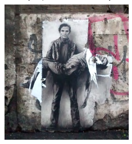
Figure 8 – Non-peaceful conversation with the public (Before)