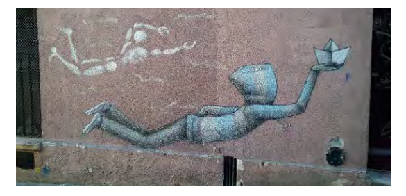
Untitled by Jérôme Mesnager & Julien Seth Malland, stencil and spray on wall, ca 200x150, Paris (France), 2013