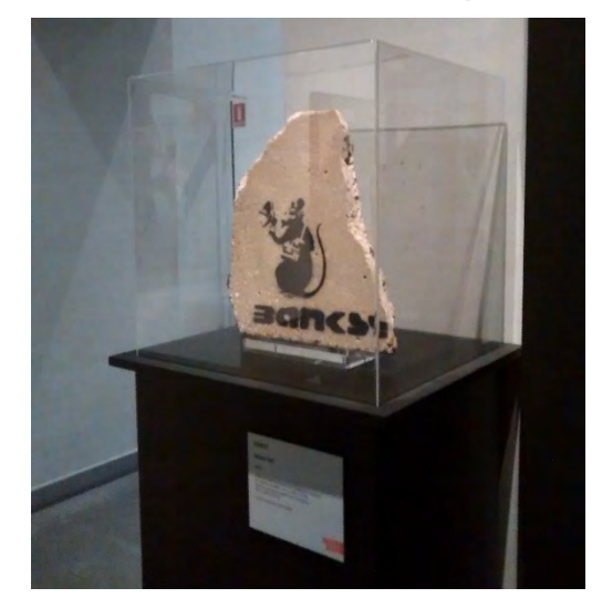
Figure 10 - Street Art transferred to Contemporary Urban Art