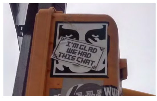
Untitled, stickers on traffic light, ca 20x20, New York (USA), 2015