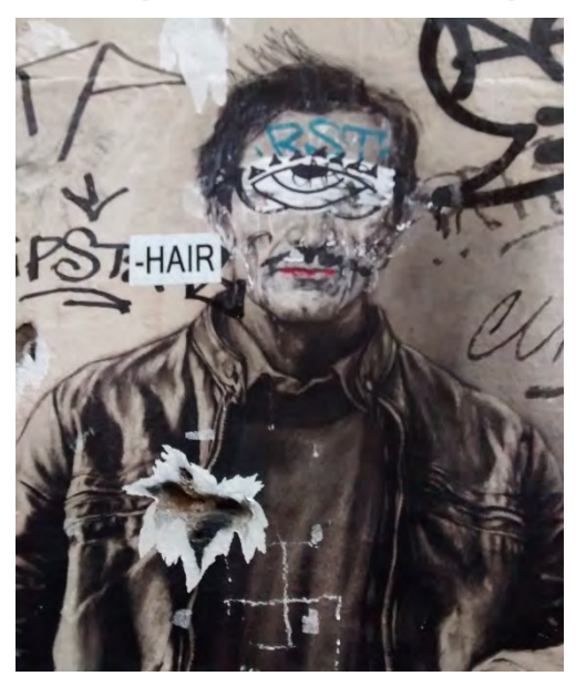
Figure 8 bis - Non-peaceful Conversation with the public (After)