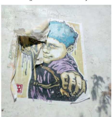
Figure 2 – Natural decay

Apart from the contextual meaning of many pieces, Street Art is also a transient form of art because the works usually do not last long. This is due to the vulnerability of their media, materials, techniques, and to the fact that they are not protected by the four walls of the White Cube but exposed to the corrosion of bad weather and sun (fig. 2).