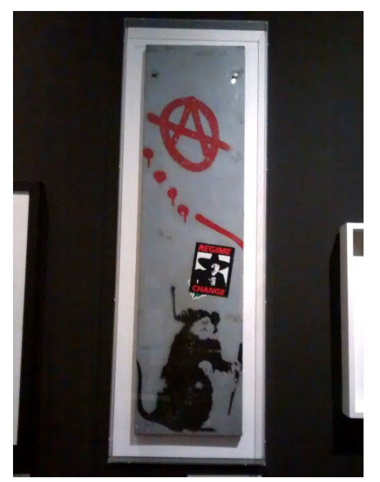
Anarchy Rat, spray on metal, 166x27.5, Exhibition Street Art Banksy & co. L'art allo stato urbano, Bologna (Italy), 2016