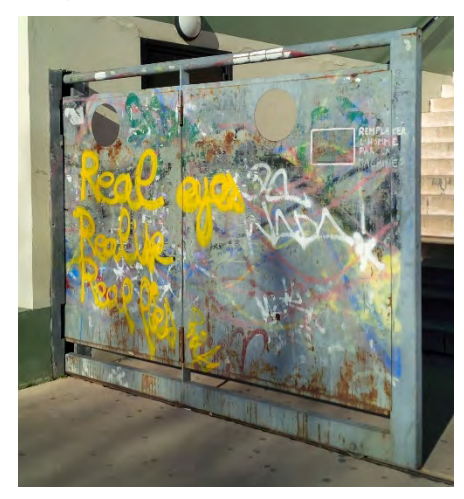
Real eyes Realise Real lies, spray on door, ca 90x120, Nice (France), February 2014

Some are "cleaned up" because situated on sensitive props, such as the entrance door of a University, symbol of the institution itself (fig. 4 and 4 bis).