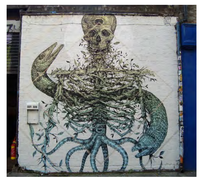
Untitled, paint on wall, ca 300x280, London (UK), 2014