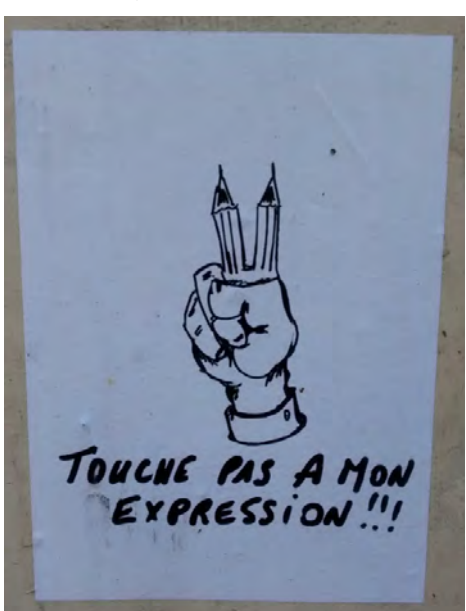
Figure 1 – Obsolescence

Mostly yes. Many pieces are tightly bound to a specific context, either political or cultural. When the context changes, so does the meaning and function of the Street Art piece. Most people still remember the terrorist attack in Charlie hebdo's editorial office in Paris, on January 2015 the 7<sup>th</sup>, about ten years after the French satirical newspaper decided, in the name of freedom of the press, to publish some controversial caricatures of Mahomet that had been published three months before in the Danish Jyllands-Posten. Therefore, even today, most people can still relate the artworks produced to their original context of the aftermath of the bloody attack. However, the ability for future generations to understand all the visual and textual references seems quite unlikely. In the following example (fig. 1), the drawing of two V-shaped pen-fingers relates to the draughtsmen targeted by the killers and the conviction that freedom of speech will win despite opposite attempts to gag it. The writing relates to two references: one is the slogan «Touche pas à mon pote» (don't touch my pal), SOS Racisme's motto, meaning solidarity with immigrants and fight against racism; the other one is the «liberté d'expression», one of the fundamental human rights expressed in the 1789 Déclaration des Droits de l'Homme et du Citoyen (although the literal expression was officially born in the Article 10 of the 1950 European Convention on Human Rights).