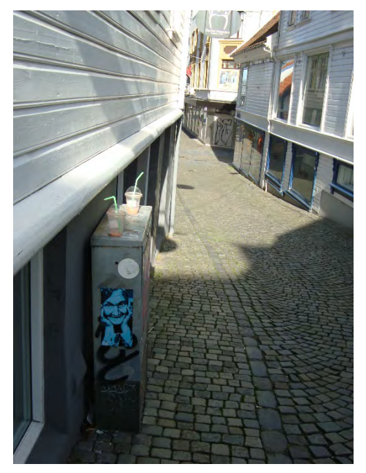
Figure 16 - Re-enchanting the experience of the city (context)