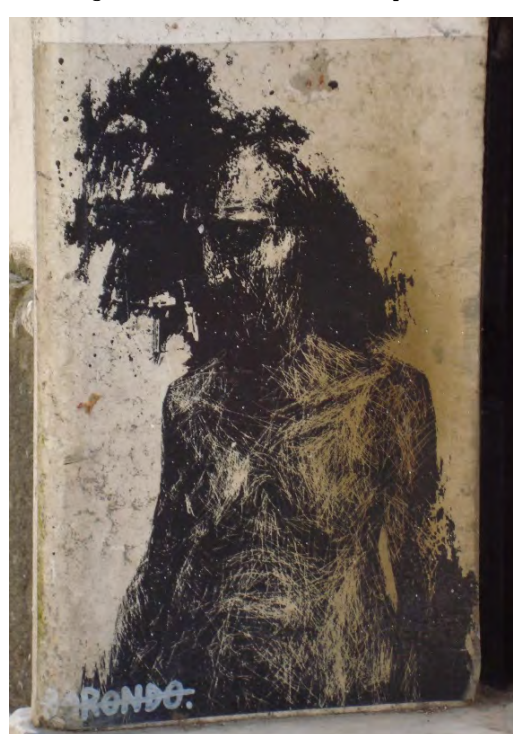
Untitled, paint on wall, ca 20x30, Rome (Italy), 2014