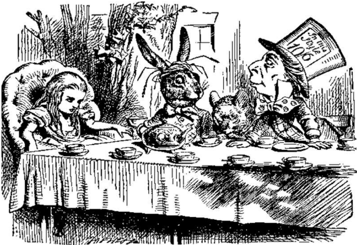
Figure 4. A mad tea party, session 4.

Usually, in-class discussions would then gradually move away from the situation in Wonderland and address the practices at Airshop 3 (Puyou, 2014). Airshop is an airport retail organization where 'members communicate but do not meet' (p.20). The company's headquarters rely extensively on digital software solutions to control operational activities reducing the need and opportunities for face-to-face interactions. In particular, several controllers in charge of performance reporting for the