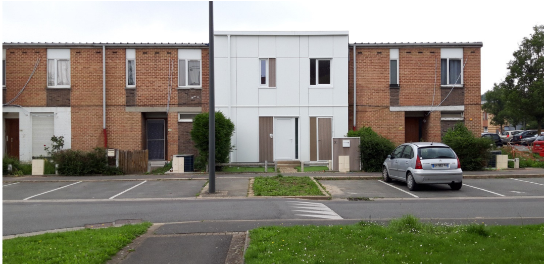
Figure 1. A prefabricated facade for a renovated house in Wattlelos.

do that, we have mobilized a large body of literature. In this corpus, three areas of study seem particularly relevant for our study: The first one explores domestic energy behaviour (Frederiks et al., 2015; Lutzenhiser & Gossard, 2000; Steemers & Yun, 2009) and, specifically, in relation to the use of new technologies and the materiality of the domestic space (Shove, 2003; Stephenson et al., 2010); the second one focuses on high-performance energy renovation projects (Gianfrate et al., 2017; Gupta & Gregg, 2016); and the last one is dedicated to the comprehension of the “energy performance gap” (Gram-Hanssen & Georg, 2018; McElroy & Rosenow, 2019; Topouzi et al., 2019; Zou et al., 2018) and of the procedures designed to deal with it, such as the EPCs (Jain et al., 2017; Lu et al., 2017; Zhang & Yuan, 2019). The analysis of literature on EPC reveals a paucity of studies, putting this contracting form in perspective with the behaviour of the occupants by illustrating the impacts that it can have on the latter, which is the perspective adopted by our study.