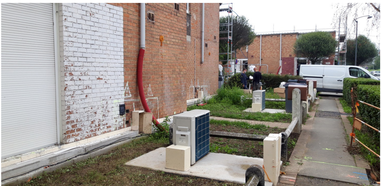
Figure 6. Heat pumps and meters in Wattlelos.

As we have seen, for the renovation project to achieve the results that the system is expected to produce and that the building owner and the consortium wants, the ways in which residents use the building and its amenities need to change significantly. In this section, we will raise the question of what happens if this behavioural adjustment does not take place. Who bears the risk associated with the EPC and who bears the cost of any overconsumption caused by misuse of the building? We will see that it is down to tenants to pay for any energy consumption that exceeds level "E = 0," but that arrangements are proposed to manage tricky or potentially conflictual situations.