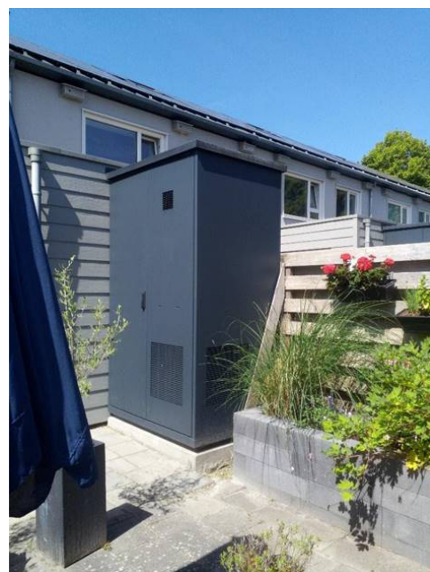
Figure 3. External plant room installed in the garden in Hem (France) and Stads kanaal (Netherlands).