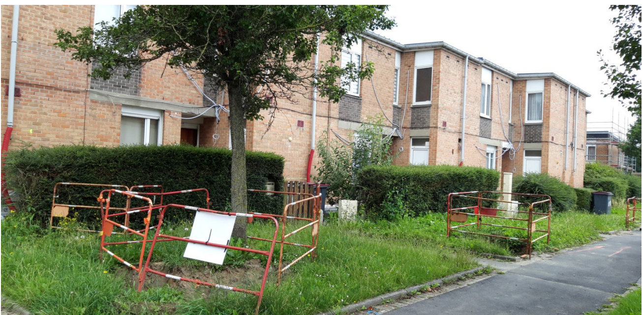
Figure 4. Public space affected by energy network upgrade in Wattrelos.

While some companies apply the learning by doing and treat this complexity as an opportunity to develop the business and their skills in working on an occupied site, others fail to cope with the challenge. As a result, the quality of the work and the relationship with tenants are compromised, and the landlord and contractors tend to blame each other for the failure (interview with the project representative of a Dutch construction firm). In addition, our interviews reveal the lack of foresight, on the part of both the landlords and the occupants themselves, about the upheaval produced by the speed of the spatial changes during the work: “At certain point when