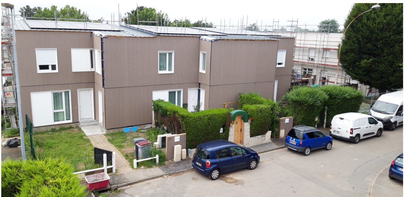
Figure 5. Wattlelos. Once the renovation is complete, residents can reappropriate their homes.