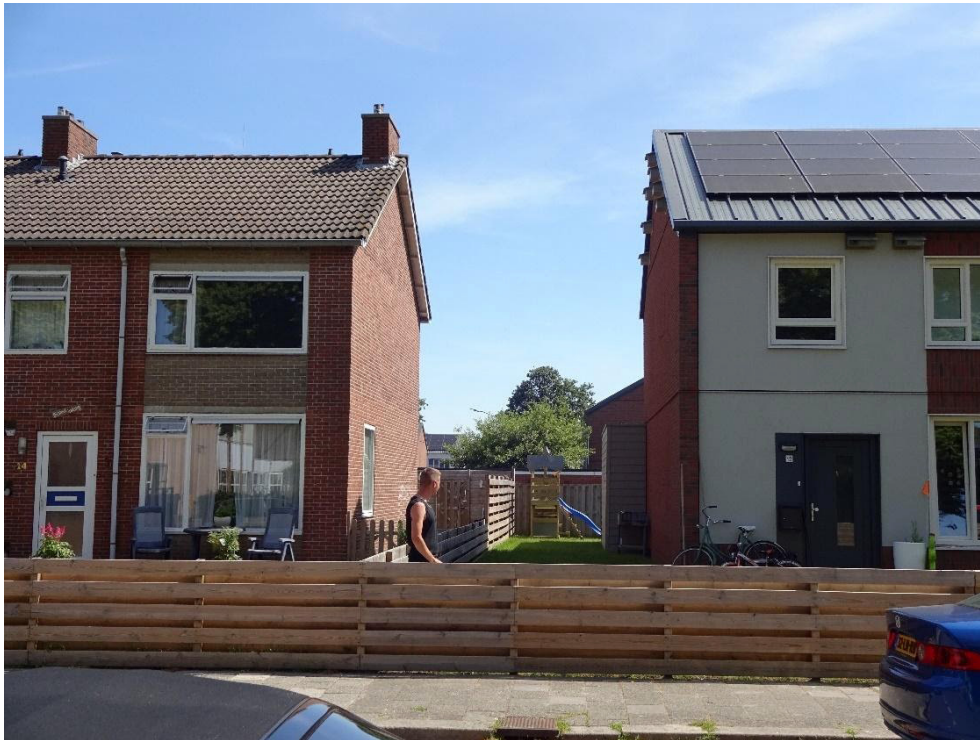
Figure 2. Stads kanaal. On the right, we can see a resident is in his garden, satisfied with his new house. On the left and in other houses of the district the renovation project did not take place because the residents were opposed to it.

innovation for the project consortium—are the installation of photovoltaic panels, a heat pump, and an external plant room (Figure 3) to manage the operation of the building’s energy system and mechanical ventilation system, the residents are more interested in very practical and much less structural questions, such as the electric hob that replaces their gas cooker. This is in fact the issue around which opposition tends to crystallise,