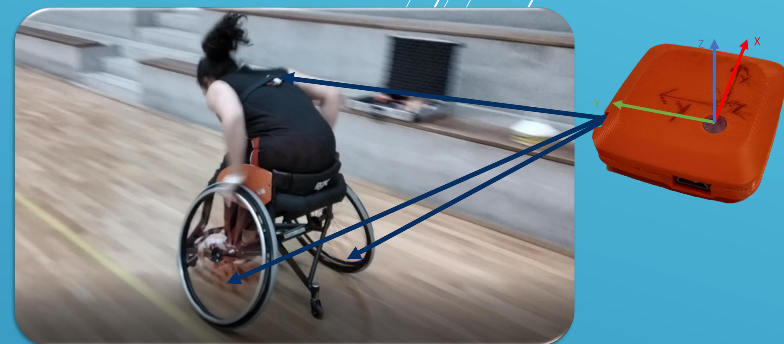
Figure 1 : Female wheelchair basketball player during a sprint with 3 IMUs.

→ Compute of wheels linear velocity and FEROMT