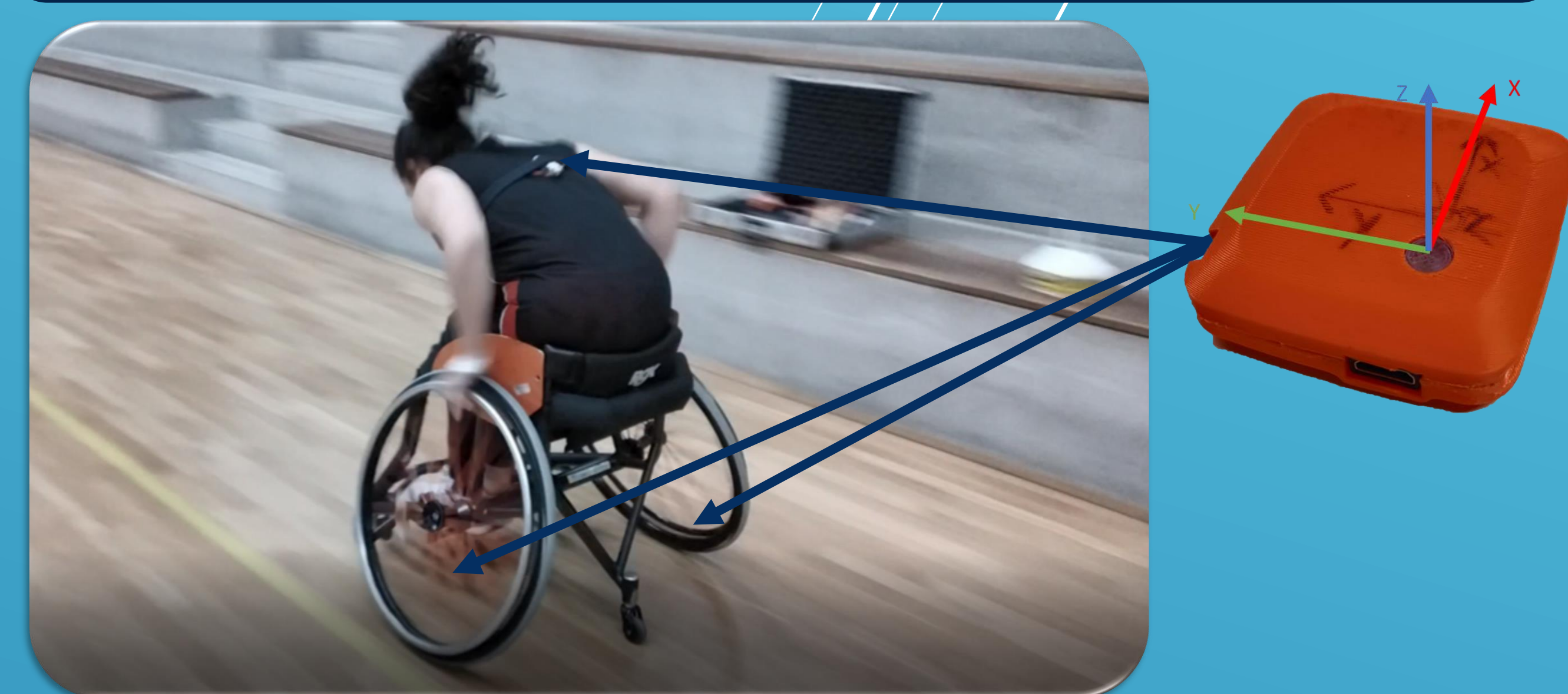
Figure 1 : Female wheelchair basketball player during a sprint with 3 IMUs.

→ Compute of wheels linear velocity and FEROMT