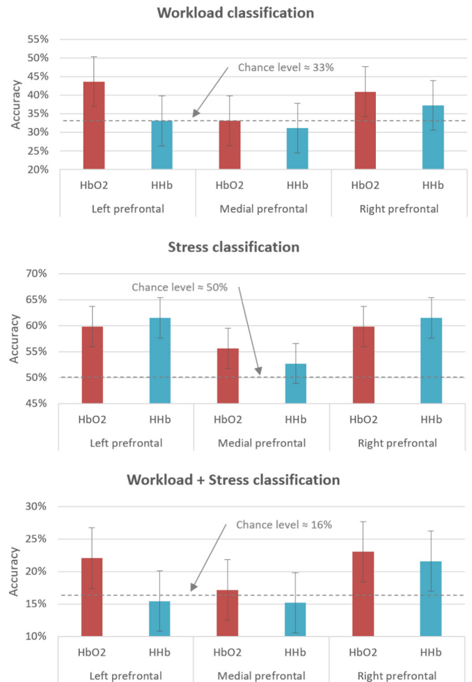
Fig. 2. Classification performance of the 3 variables (mental workload, stress, mental workload+stress) for the 3 prefrontal AOIs (left lateral, medial, and right lateral) and the 2 fNIRS signal (HbO2 and HHb). Dotted line shows chance level.

Finally, we used a generalized linear regression model following a binomial distribution to analyze which factors contributed the most to classification performance. While some of this information is conveyed in the previous figures, a generalized linear regression model allows statistically rigorous verification of the previously obtained results and the inclusion of several other independent variables. We used classification success of each 2292 trials (382 trials × 6, since six classifiers were compared) as dependent variable (0 = wrong classification, 1 = correct classification), while independent variables included in the model were AOIs (i.e., left, medial, right), fNIRS signal type (HbO2 or HHb), mental workload (0-back, 1-back, 2-back), and stress levels (safe, threat). We also included demographic information (gender and age), anxiety ratings (from the STAI Y-A questionnaire, before and after the experiment), and difficulty ratings (from the DP-15 questionnaire, for 0-back, 1-back, and 2-back). Multicollinearity was assessed using the Variance Inflation Factor (VIF; Belsley et al., 1980). The highest VIF obtained was 3.9, which is lower than the threshold commonly considered for multicollinearity issues (Kutner, Nachsheim & Neter, 2004; Sheather, 2009). Thus, all variables were kept in the regression analysis.