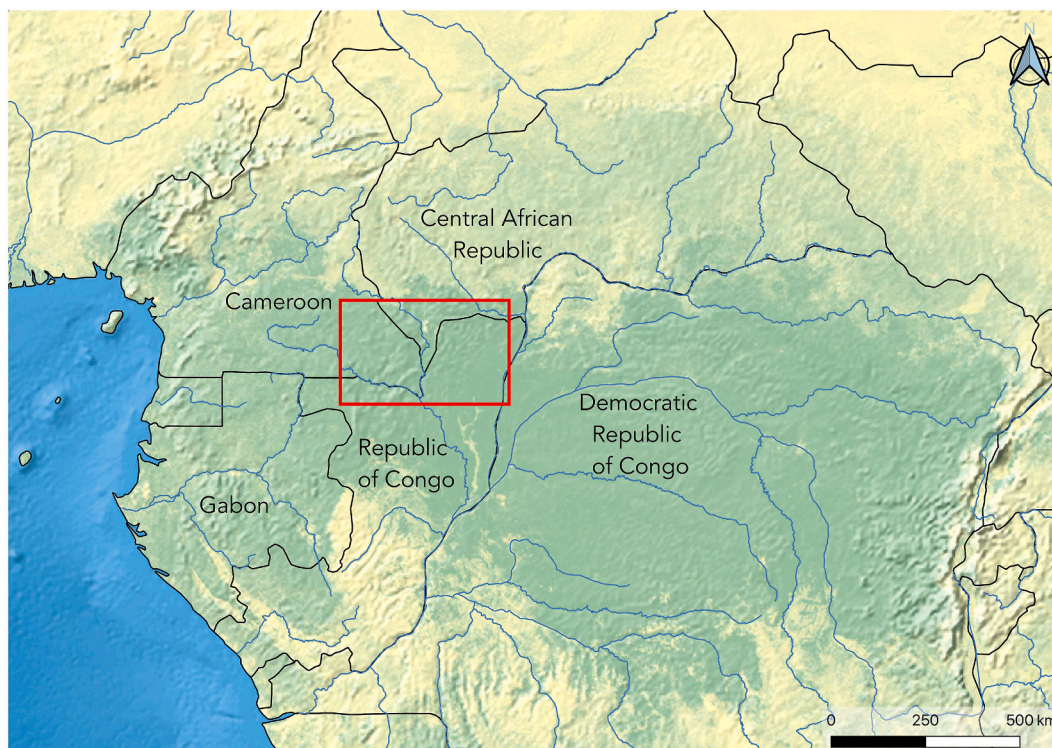
Fig. 1. Map of central Africa and authors' research area (R.D. and T.G-V.).

As one of the most neglected tropical diseases, SBE constitutes a significant public health burden in central Africa (Halilu et al., 2019). The risk of SBE is difficult to evaluate, not only because of patchy hospital statistics, but also because forest inhabitants and rural populations do not tend to seek biomedical care for snakebites (Balde et al., 2005). A meta-analysis of published studies from sub-Saharan Africa between 1970 and 2010 estimated mortality at more than 7000 cases per year, although this figure may be an underestimate (Chippaux, 1998, 2011; Halilu et al., 2019).