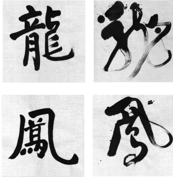
Examples of pairs of characters. Left: with low emotional intensity (LEE); right: with high emotional intensity (HEE)