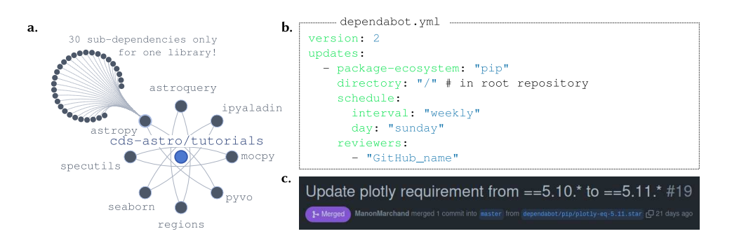
Figure 2. Dependencies management (a.) With the exponential number of dependencies of any project, dependency management requires bots that can be configured (b.) in an easy workflow (c.) to trigger an automatic pull request each time a new compatible dependency is available in a specified package index – such as the pip registry for Python projects.

Jupyter notebooks maintenance tips and tricks