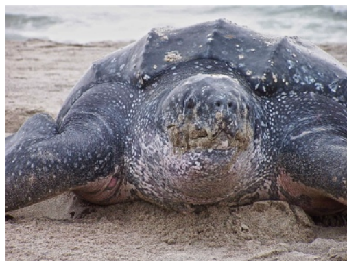
Illustration de la couverture :