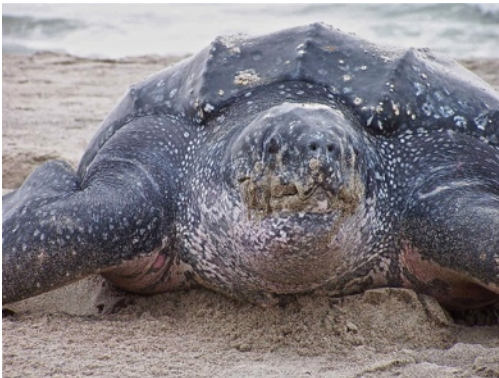
Illustration de la couverture :