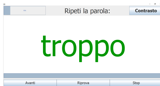
Fig. 2. Screenshot of RECORDIA GUI during Level 1 recording procedure.

The Figure 4 shows the distribution of pathologies in the IDEA database. This information can be inferred by the last column of Table 2.