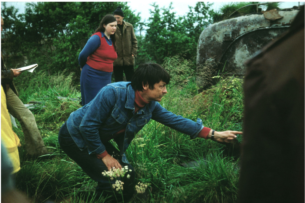
Figure 5. Andrei Tarkovsky surrounded by plants during the shooting of Stalker (1979)