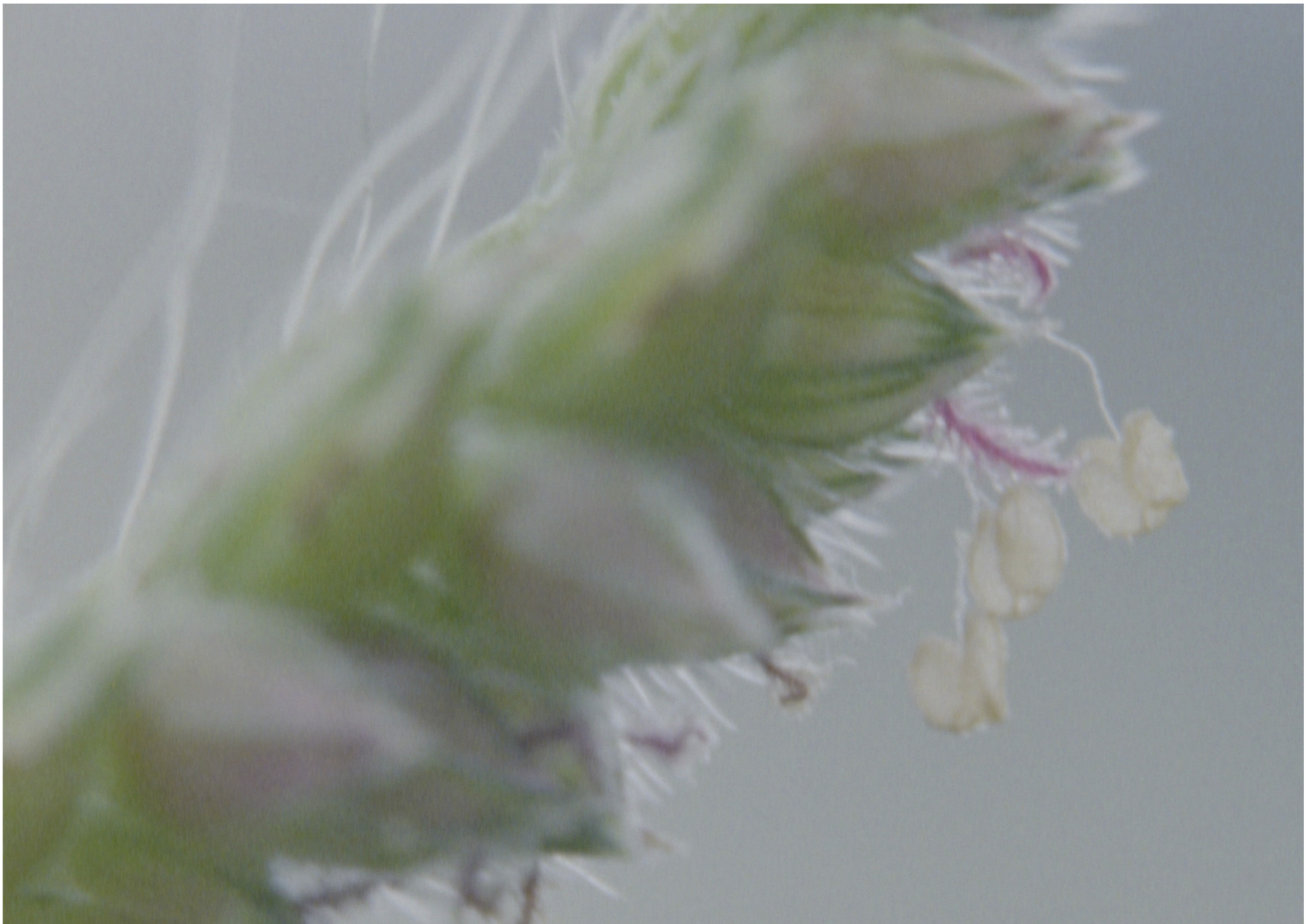
Figure 7. Wild millet, film still from Mikhail Lylov and Elke Marhöfer, Soil-Habit-Plants , 2017 (© Mikhail Lylov and Elke Marhöfer).

But the filmmakers also direct their attention to soil. Shot by Marhöfer with a macro lens (Lylov filmed the plants), the soil sequences are particularly striking. The ground level point of view adopted, as well as the unstable use of focus—the extreme close-ups of the soil, plants and even micro test plates oscillate between sharpness and blurriness (Figure 7) 40 —contribute to the feeling of a cinema unfettered by human-centred standards.