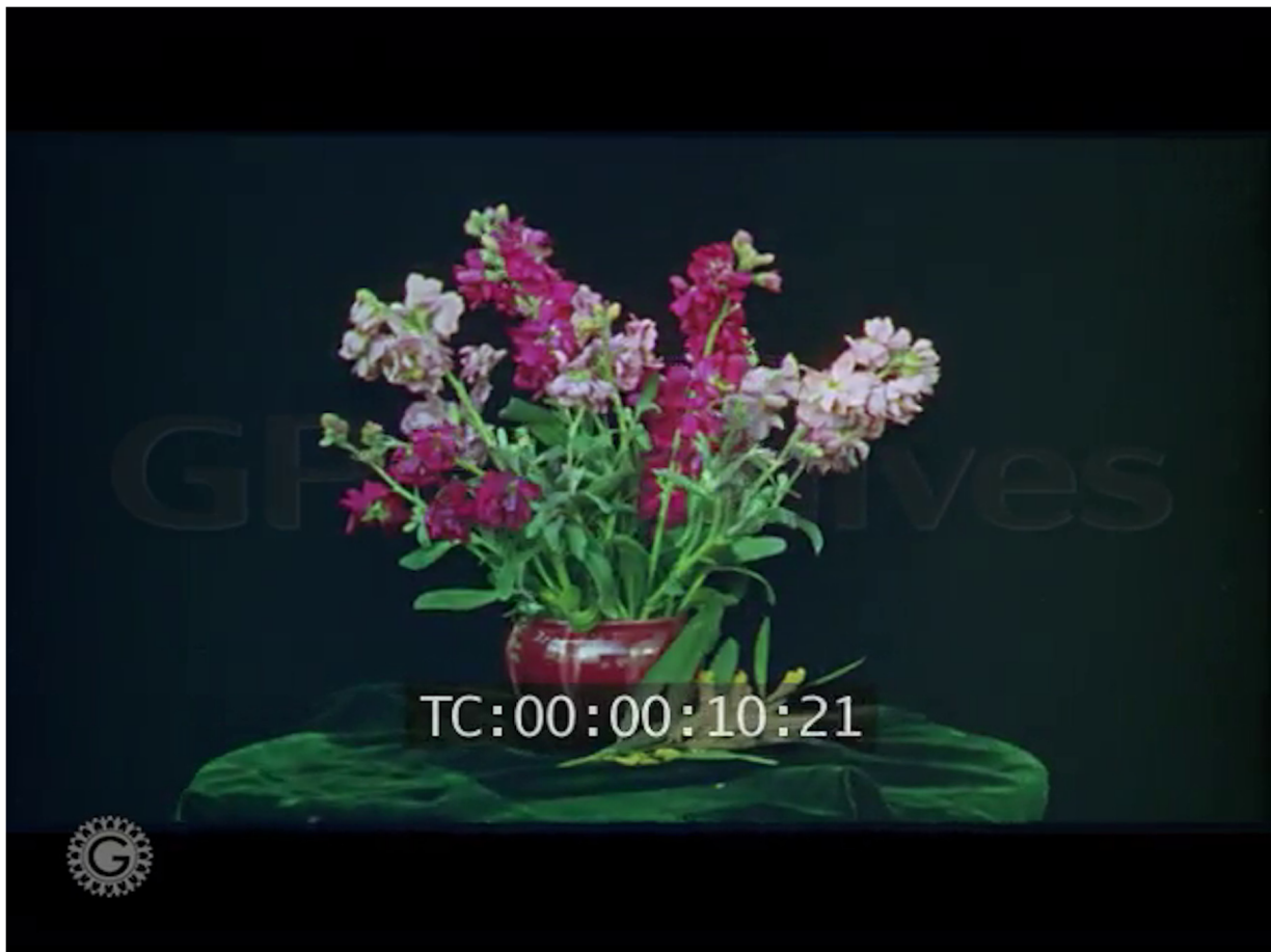
Figure 1. Film still from Bouquets dans des vases , Gaumont, 1912.

Nonetheless, beyond the specific interest evinced by a handful of experts and scientific popularisers alike in vegetative movements (and the audiences’ continuing fascination with time-lapse technology), plants were rarely promoted to the role of film stars 7 . Certainly, once stencilling became mechanized (1907) and as different additive two- and three-colour systems were perfected in the following years, flowers graciously lent themselves to the spectacular showcase of flamboyant palettes, like in Gaumont’s Études des fleurs (“The Kingdom of Flowers”, 1910) [5] or Bouquets dans des vases (“Bouquets in vases”, Gaumont, 1912) [6] (Figure 1). Placed on rotating pedestals, as if arrayed behind the glass of a fancy shop window, flowers (but also fruits and vegetables) occupy the centre of the screen. But such films are exceptional, and the subgenre too modest with regards to its supposedly phytocentric ambitions, to turn plants into more than just a curious footnote in the history of cinema.