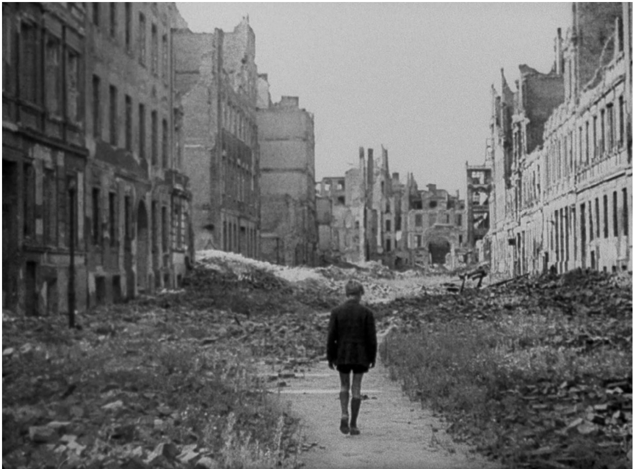
Figure 2. Ruderals surround Edmund, film still from Germania, Anno Zero (Roberto Rossellini, 1948).

questions of social justice, very often implicating immigrant and racialized communities. “Exploring Berlin’s urban ecologies ethnographically”, she writes, “involves looking for unanticipated human-nonhuman interactions that occur at the edges of the city’s infrastructures and that do not adhere to national or capitalist schemes for multicultural gardening and rehabilitating nature” (p. 309, [17]). To put it differently, urban and ruderal ecologies bring about untamed forms of diversity, beyond strict garden infrastructures and their designs on vegetal life 27 .