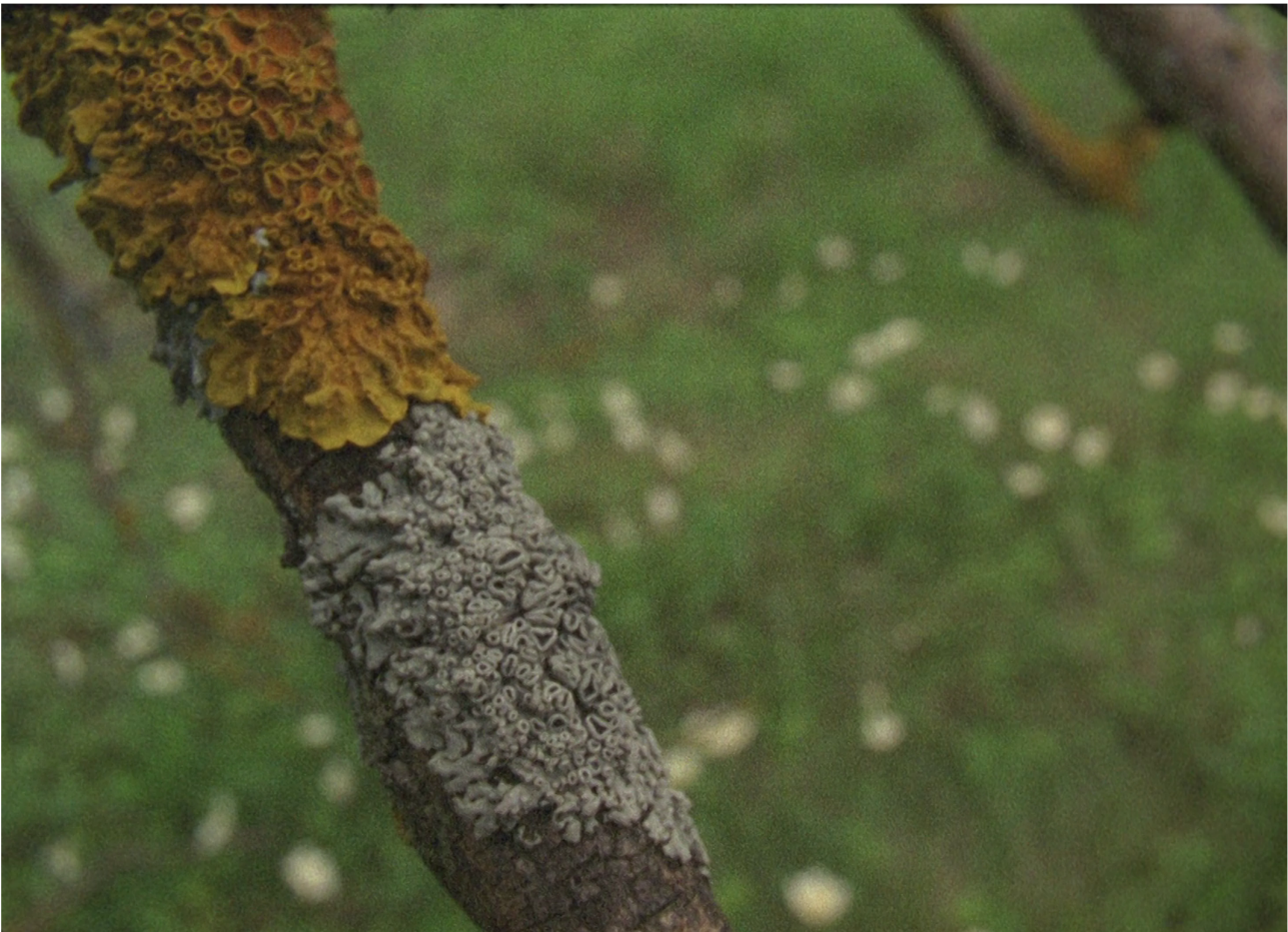
Figure 8. Lichens, film still from Elke Marhöfer, Becoming Extinct (Wild Grass) , 2017.

Lichens feature prominently in Marhöfer's Becoming Extinct (Wild Grass) (2017), a film shot in the Russian Southern steppes, in the Divnogorye Natural Museum reserve, as the crow flies not very far away from Chernobyl (Figure 8).