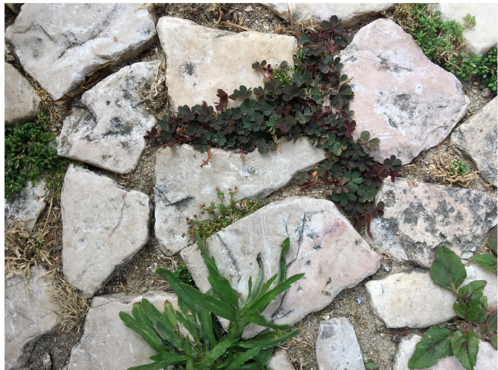
Figure 3. Ruderal plants growing in the cracks of a cobblestone pavement, Lisbon, Portugal, 2022

Standing for the alien, the undesirable, the out of place—but also for the multiple, the decentred and the entangled—ruderals, like “weeds”, are fitting companions for those who grow in-between (Figure 3). Those who prosper in the fissures and cracks of dominant discourses; those who infuse wildness and diversity in all sorts of toxic monocultures. Those, in sum, who invite us to read against the grain of conventional natural and cultural histories. After all, ruderal plants are the migrants of the vegetable realm, the anti-forest of urban wastelands, the overlooked flora of our ecological obliviousness. They are the vegetation of the contaminated commons, the interstitial condition of the undercommons 30 . They embody what Tsing calls “third nature”: precarious forms of multispecies coexistence in the ruins of advanced capitalism 31 . In other words, the possibility of transforming “the dump” into a breeding ground for life: the prospect of world-making in the midst of the devastation.