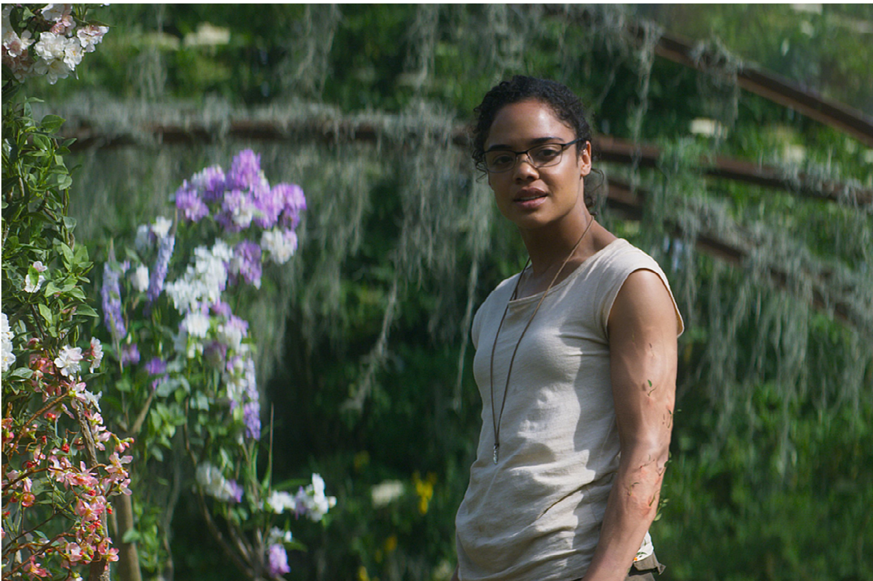
Figure 6. Flowers sprouting on Josie Radek’s arm, film still from Annihilation (Alex Garland, 2018).