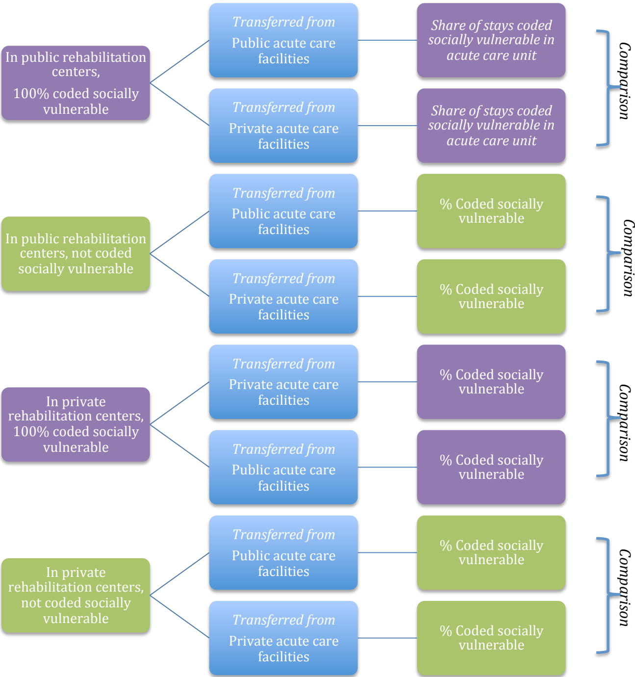
Figure 1: The comparison groups