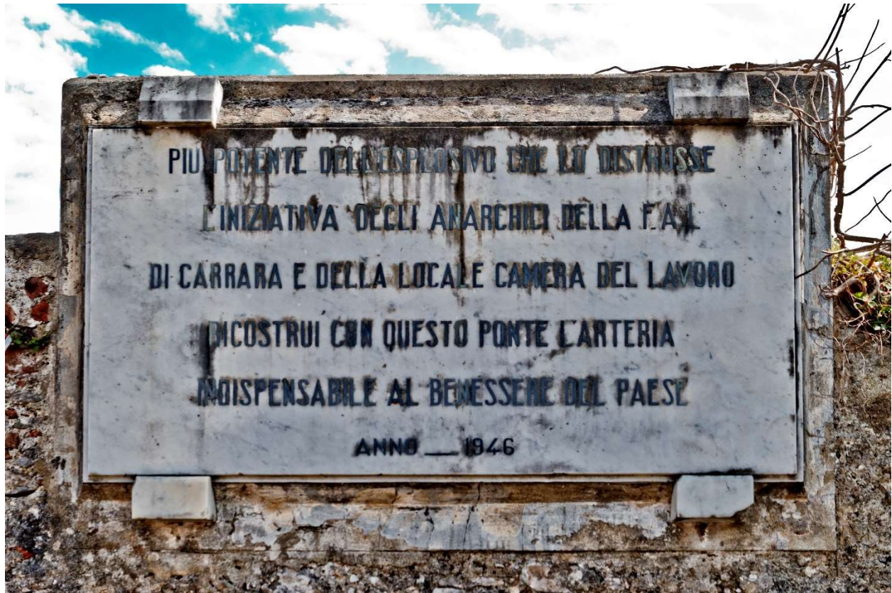
Fig. 4. Carrara, San Martino. Anarchist plaque placed in 1946 on the bridge of the Marble Railway that was destroyed by the Nazis and immediately reconstructed by anarchist partisans: ‘Stronger than the explosive that destroyed it, the initiative of Carrara FAI anarchists and of the local Hall of Labour reconstructed this bridge as the indispensable vessel to the wealth of the country’

Actions such as reconstructing the bridge of the railway used to transport marble from the mountains to the port proved the strength of Carrara anarchists in 1945. 69 This impressed the delegates proceeding to the Congress from other regions, who noted how the entire town was mobilized for that event. In the recollections of Roman activist Renato Gentilezza, one can appreciate a long lasting aspect of the ritualization of public space which currently appears during the May Day events: that is, music. In 1945, during a big demonstration in downtown streets, a