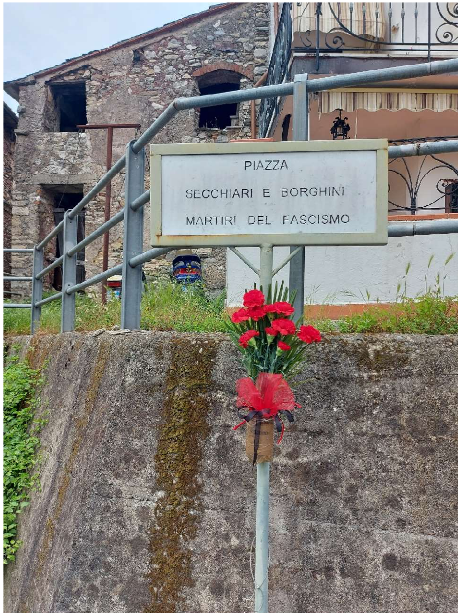
Fig. 10 Gragnana. ‘Square Secchiari and Borghini, martyrs of fascism’

F. Ferretti, 2022, “Statues that must stand not fall: the material agency of anarchism in the marble monuments of Carrara, Italy”, Journal of Historical Geography , special issue Contesting monuments: heritage and historical geographies of inequality . Early view: https://www.sciencedirect.com/science/article/abs/pii/S0305748822000779