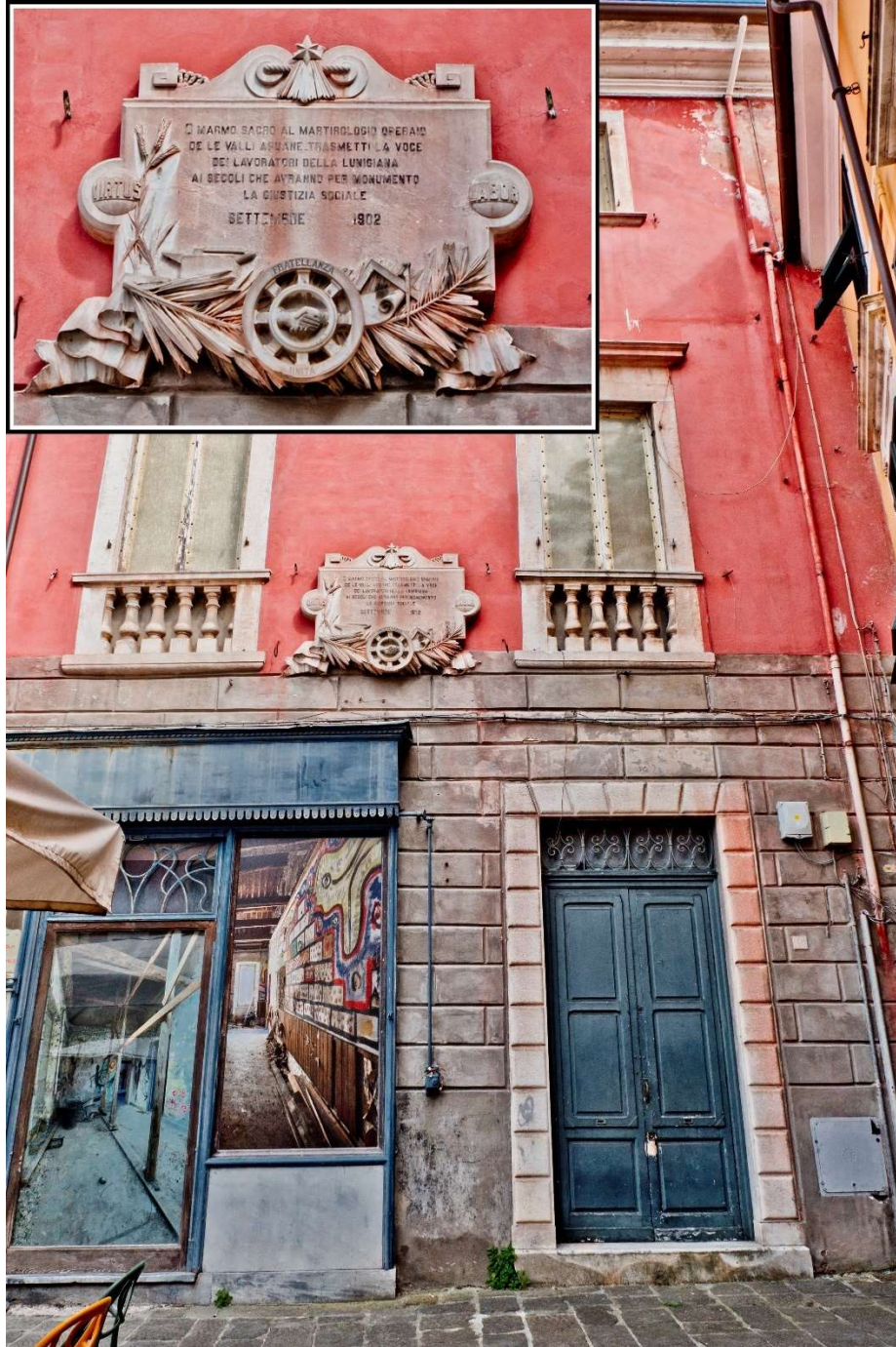
Fig. 5. Carrara, Piazza Alberica. ‘Oh, Marble sacred to workers’ martyrdom, from the Apuan valleys bring the voice of Lunigiana workers for the centuries that will enjoy social revolution as their monument. September 1902’

F. Ferretti, 2022, “Statues that must stand not fall: the material agency of anarchism in the marble monuments of Carrara, Italy”, Journal of Historical Geography , special issue Contesting monuments: heritage and historical geographies of inequality . Early view: https://www.sciencedirect.com/science/article/abs/pii/S0305748822000779