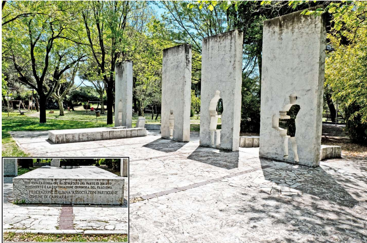
Fig. 11. Marina di Carrara. Monument to all victims of fascism, 1979. In the detail, the inscription added to the block that was tore down by a fascist dynamite attack in 1981: ‘1921-1981. The bomb that devastated a part of this monument is the criminal continuation of fascism’