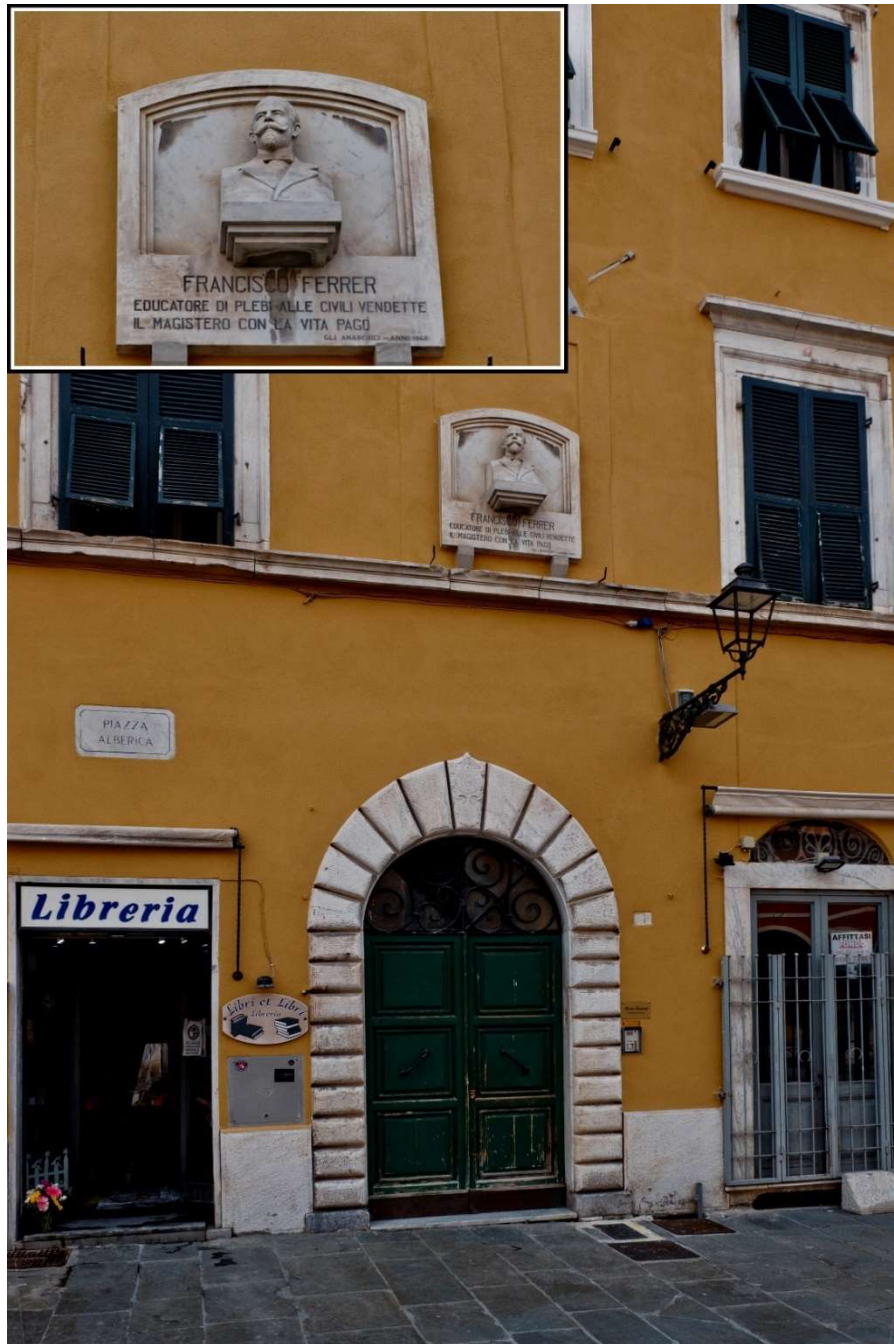
Fig. 6. Carrara, Piazza Alberica. ‘Educating the plebs to civic rescue, Francisco Ferrer paid his teaching with his life. The anarchists, 1946’ (Photo Gian Maria Valent, 2022)

F. Ferretti, 2022, “Statues that must stand not fall: the material agency of anarchism in the marble monuments of Carrara, Italy”, Journal of Historical Geography , special issue Contesting monuments: heritage and historical geographies of inequality . Early view: https://www.sciencedirect.com/science/article/abs/pii/S0305748822000779