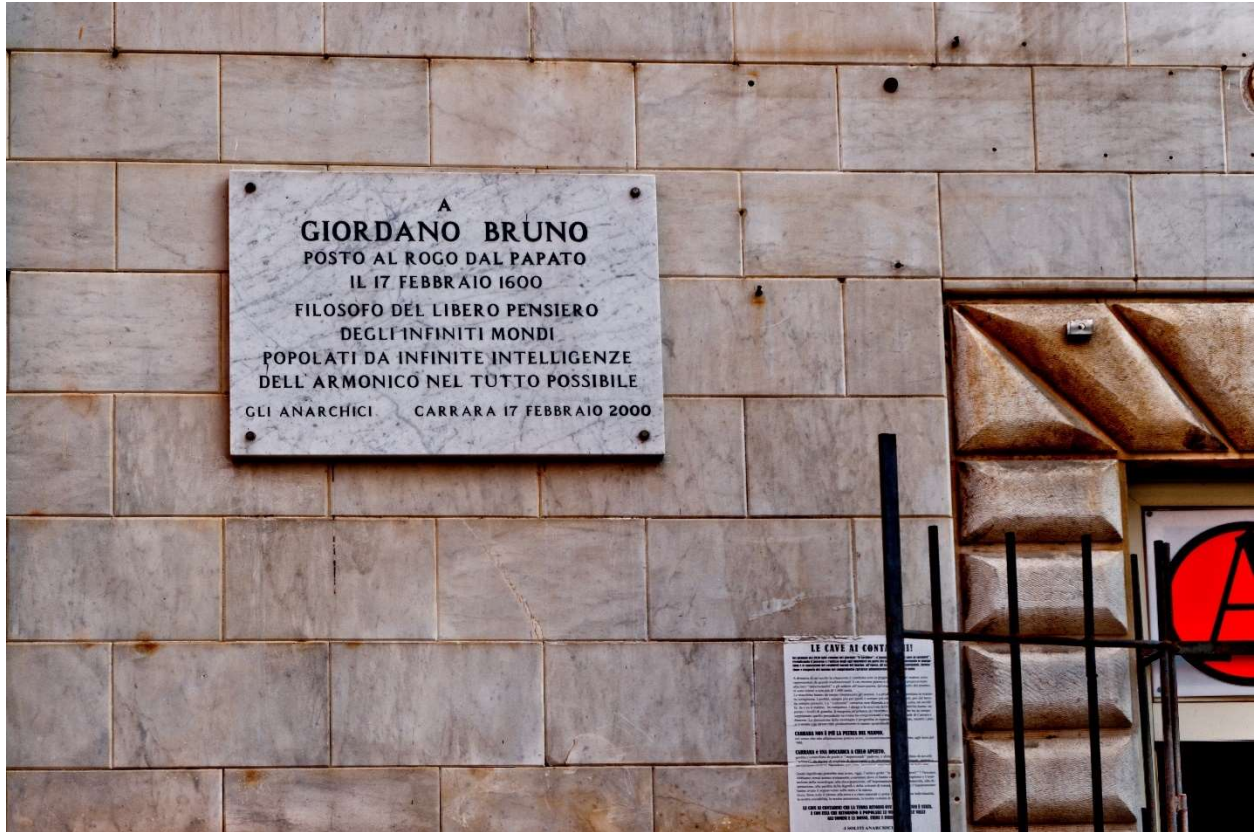
Fig. 7. Carrara, Piazza Duomo. ‘To Giordano Bruno, sent to the stake by the Papacy on 16 February 1600, the philosopher of free thought and of the infinite worlds populated by infinite intelligences, in the ever-possible harmony. The anarchists. 17 February 2000’

Today, the Giordano Bruno plaque is located at the right side the provisional headquarters of the Anarchist Federation. These locals are occupied since 2008, when the historical FAI building popularly called ‘Germinal’ in Piazza Matteotti became inaccessible after internal collapses relatedly due to a building speculation that a private enterprise tried on the upper floor. This occurred in the context of the multiyear struggle of Italian anarchists to defend the historical buildings that they obtained since 1945 based on their participation to the Resistance and related agreements with the other antifascist parties on the restitution of their historical patrimony