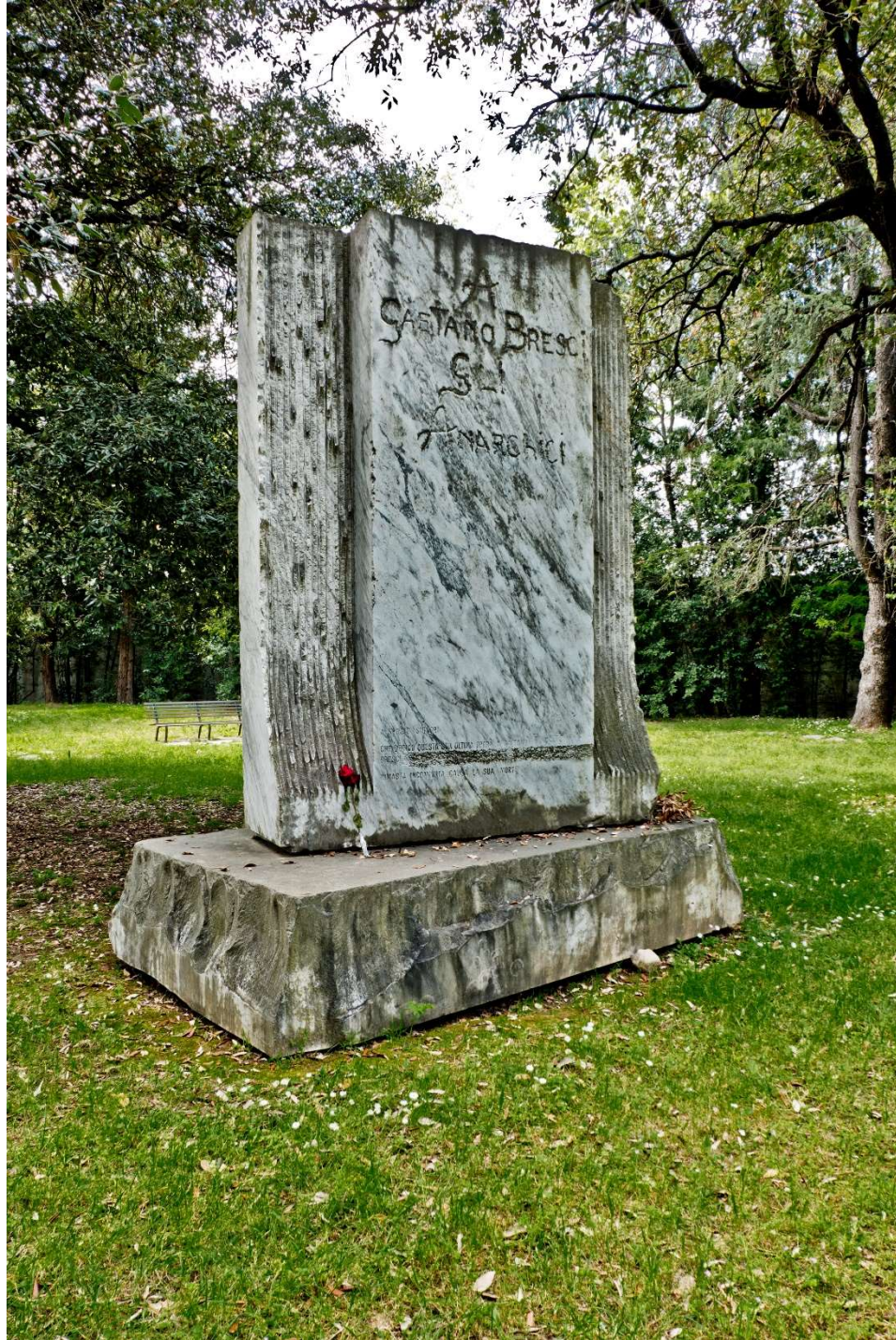
Fig. 12. Carrara. Stele to Gaetano Bresci, 1990, by Carlo Sergio Signori

F. Ferretti, 2022, “Statues that must stand not fall: the material agency of anarchism in the marble monuments of Carrara, Italy”, Journal of Historical Geography , special issue Contesting monuments: heritage and historical geographies of inequality . Early view: https://www.sciencedirect.com/science/article/abs/pii/S0305748822000779