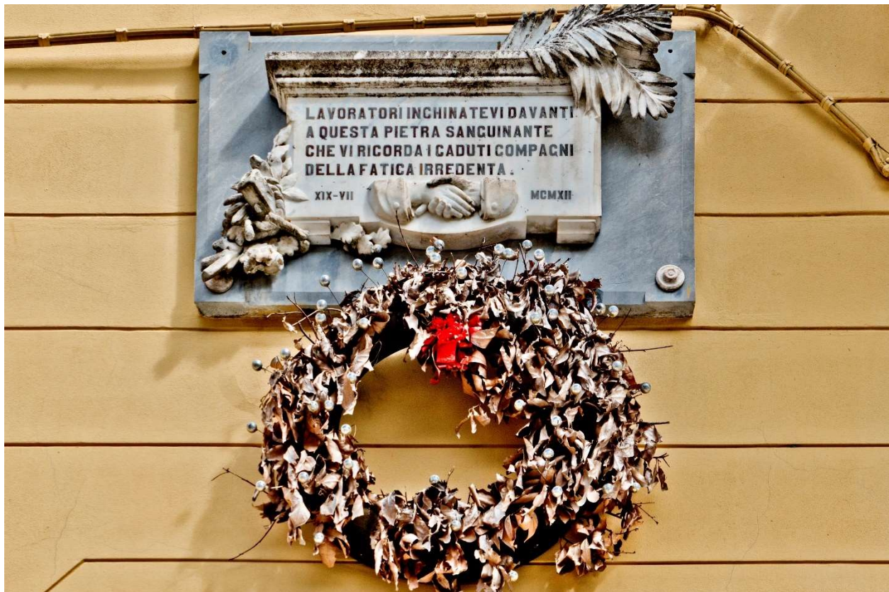
Fig. 1 – Torano. Marble plaque installed on 19 July 1912 on the local Casa del Popolo (People’s House). ‘Workers, bow down before this bleeding stone that remembers your comrades fallen during unrecognized labour’

The working conditions of marble labourers triggered strikes and the rising of class struggles to compel entrepreneurs to invest more in safety measures. On the other, this indissoluble relation of life and death, and of marble and people, led to an almost-apotropaic humanisation of the matter, usually defined as ‘the bleeding stone’ in the marble plaques commemorating the ‘Martyrs of Labour’, 8 to which periodical floral tributes are brought by the participants to events such as the traditional May Day demonstrations (Fig. 1).