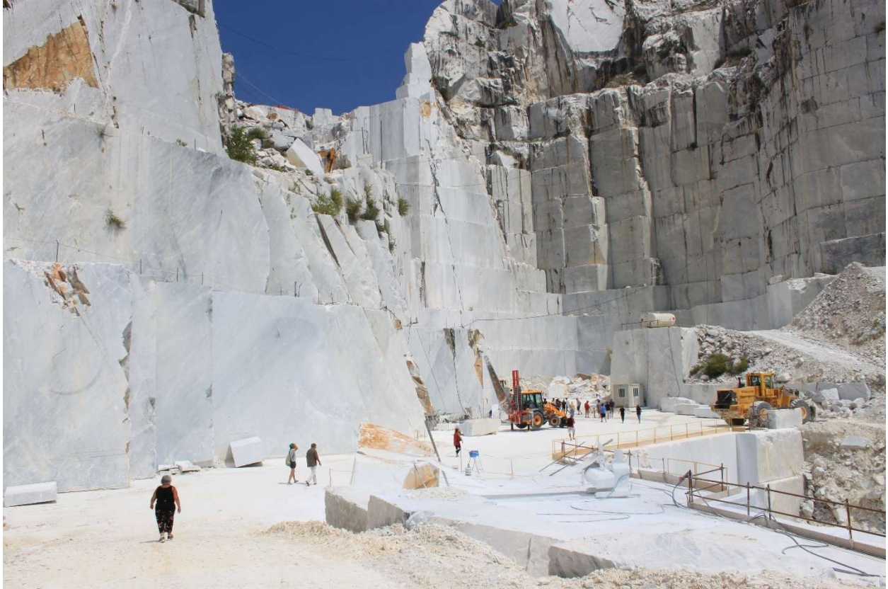
Fig. 2. A marble quarry near Carrara during a visit organized by the Anarchist Federation of Reggio Emilia in July 2019

F. Ferretti, 2022, “Statues that must stand not fall: the material agency of anarchism in the marble monuments of Carrara, Italy”, Journal of Historical Geography , special issue Contesting monuments: heritage and historical geographies of inequality . Early view: https://www.sciencedirect.com/science/article/abs/pii/S0305748822000779