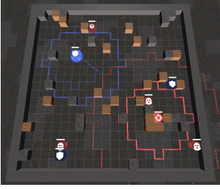
Fig. 1: Screenshot of the environment

game, see Fig. 1. In this video game 2 teams fight to the death on a 2D square based board with covers laid randomly. One team, composed of 3 heroes, is controlled by the agent trying to learn, and the other team is controlled by hand-crafted decision functions, designed by us like any Non Player Character (NPC) would be in most video games.