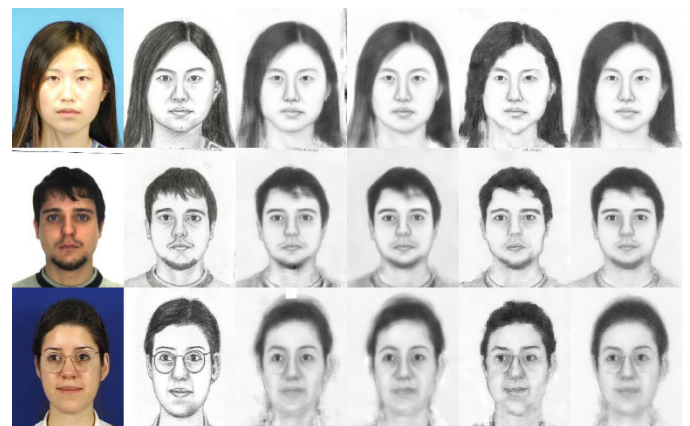
Fig. 2. Synthesized face sketch examples by four data-driven methods on three datasets. The first column is the input photo and the second column is the corresponding sketch drawn by the artist. The third to the last column are the results of LLE, SSD, MRF and MWF methods. These three face photos are from the CUHK Student, AR, and XM2VTS dataset respectively.

An illustrative example of the synthesized face sketch by the four exemplar-based methods considered in this work is shown in Fig. 2. To conduct training-free recognition, 338 synthesized face sketches (100 CUHK + 43 AR + 195 XM2VTS) were used as the probe set, and the corresponding ground-truth sketches drawn by the artist were taken as the gallery set (it is also the