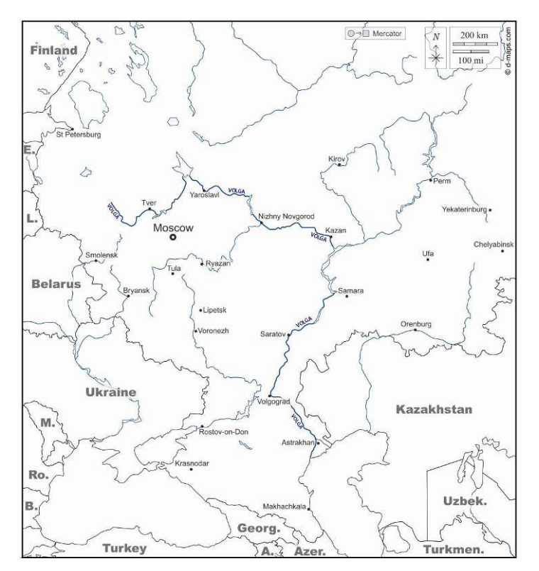
© Olivia Dejean (Cercec, CNRS) https://d-maps.com/carte.php?num_car=30399&lang=en