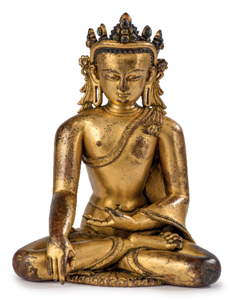
Fig. 7 Crowned Shakyamuni Buddha Khasa Malla style, 14th century Gilt copper, 24.9 cm Fondation Alain Bordier (ABS 184)

the validity of a so-called Khasa Malla style and the modalities of accession to art during the medieval period. Undoubtedly, the metal statuary in question is the art of an elite with financial and geographical access to foreign artistic centres. The Khasa Malla kings may have acquired metal sculptures and paintings through the looting activities involved in their territorial conquests and various raids