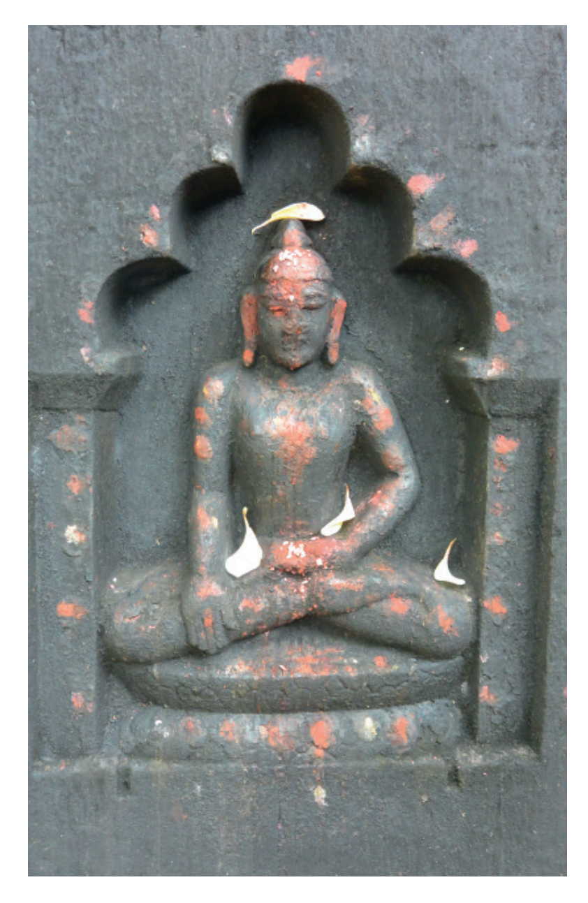
Fig. 6 Sculpture of Shakyamuni Buddha in the niche of a memorial pillar Nepal, Dailekh district, Padukasthan Second half of the 13th century Stone, niche 60 x 43 cm

Ripu Malla is known from inscriptions dated between 1312 and 1314. Although his reign was one of the shortest of the Khasa Malla dynasty, he appears as one of the most prolific kings in terms of religious activities. Our seminal study of Ripu Malla's career leads to a reassessment of metal sculptures attributed to the Khasa Malla rulers. The contextualization of these objects reveals that artistic idioms of the concerned period and area are, in fact, multiple. It is safe to say at this point that an entity such as the Khasa Malla/Yatse empire cannot be essentialized to a single style or type of artistic production. One may consequently question