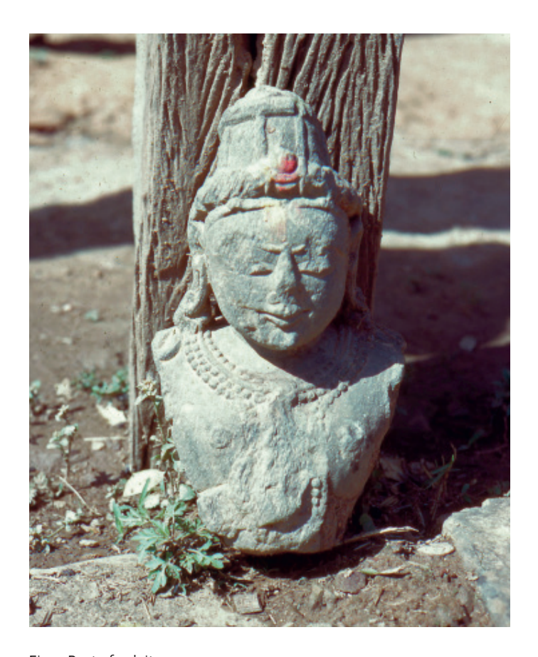
Fig. 5 Bust of a deity Nepal, Dailekh district, Dullu Maru-Gurjara style 10th–12th century Stone, 20 x 11 cm

This rapid overview wouldn't be complete without mentioning the Hindu statuary found in Khasa Malla territory. In the Achham district, the Shaiva pilgrimage site of Vaidhanath counts a number of stone Shiva and Vishnu sculptures. The images in presence, notably two Vishnu Shesashayin, a broken Durga Mahisasuramardini, and a Chamunda, are stylistically attributable to 10th- to