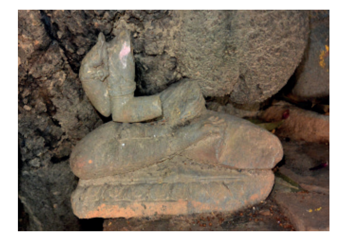
Fig. 4 Buddhist deity Nepal, Dailekh district, Dullu, Dharma Gaddi Kathmandu valley style, 14th–15th century Stone, 26 x 24 cm

Nevertheless, this facial feature was already present in 8th- to 10th-century Maru-Gurjara productions from Masrur and Bajaura (in Himachal Pradesh), for