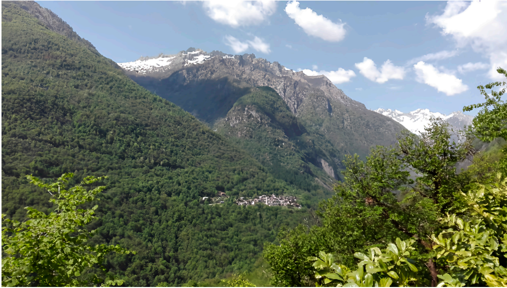
Fig. 4. Cevo in the lower part of Val Masino