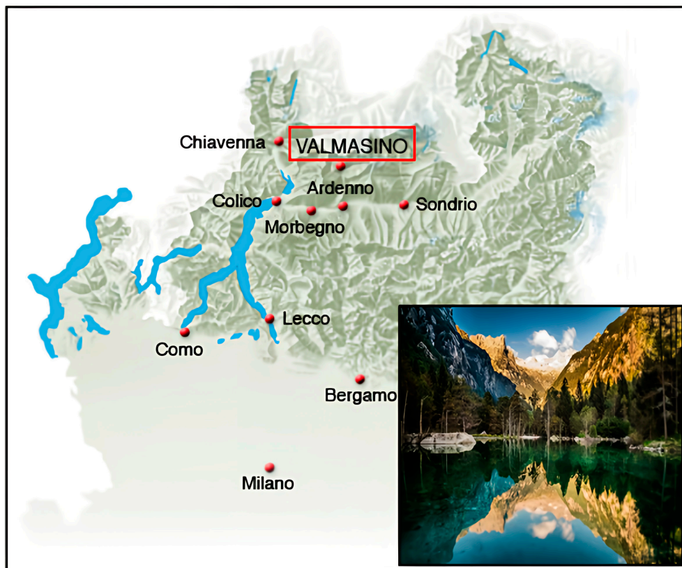
Fig. 1. Val Masino, province of Sondrio, Lombardy, Northern Italy (Federica Salamino)

and the Netherlands, both controlled by Spain during the seventeenth century. However, from 1512, Valtellina (with the counties of Bormio and Chiavenna) belonged, albeit with different levels of subjection, to the Swiss Republic of the Three Leagues, today the canton of Graubünden. Valtellina has been also known for giving its name to a part of the Thirty Years' War (1618–1648) called the Valtellina War (1620–1626) (Sella, 2003), and for a very sad episode during this period marked by religious tensions between Catholics and Protestants: the so-called Sacro Macello (the sacred slaughter), when many Protestants were massacred with the support of the Spanish troops on the night of 18/19 July 1620 (Cantù, 1853). In October 1797, the valley was annexed to the new Cisalpine Republic, before joining the Kingdom of Lombardy-Venetia after the Congress of Vienna in 1815. Valtellina was finally attached to the Kingdom of Sardinia in 1859, and then the Kingdom of Italy in 1861.