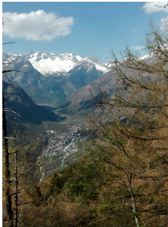
Fig. 3. View of Val Masino Cataeggio, Filorera, and San Martino (upper valley)

Geographically isolated, inhabitants descend daily from the valley to the nearest urban centres of Morbegno and Sondrio for work, official matters or leisure activities. This isolation, in the past, was a major reason for leaving and finding new opportunities elsewhere. Migration flows to Argentina and the United States began at the end of the nineteenth century and lasted up to the 1950s. At the beginning, these waves of migration were individual – men used to migrate seasonally or for a long period of time (about 8–10 years); entire families joined them later and resettled in these countries. After World War II, another wave of migration from Valtellina was observed – to Australia, especially to Adelaide, South Australia. From the 1960s, flows moved towards Italian urban areas such as Milan, Rome, and the region of Brianza (Lecco, Como and Monza); neighbouring Switzerland (in particular cantons such as Graubünden, Ticino, Basel-Landschaft and Zurich); and to a lesser degree – Germany, the United Kingdom and France.