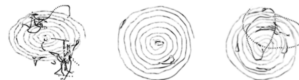
Figure 7. AD hybrid spiral images embedding pointwise velocity values in grayscale. Low and high-velocity values on both pen-down and pen-up trajectories are displayed from white to black, respectively.

In hybrid velocity images of AD patients shown in Figure 7, we observe that the in-air trajectory points (pen-ups) show higher velocity values than on-paper trajectory