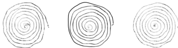
Figure 6. HC hybrid spiral images embedding pointwise velocity values in grayscale. Low and high-velocity values on both pen-down and pen-up trajectories are displayed from white to black, respectively.