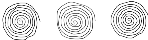
Figure 4. HC hybrid spiral images embedding pointwise pressure values in grayscale. Low and high-pressure levels on pen-down trajectories are displayed from white to black, respectively.

Figures 4 and 5 display examples of images embedding pressure information (referred to in the following as "hybrid" pressure images). Figures 6 and 7 show images of the same persons of Figures 4 and 5, embedding velocity information (referred to in the following as "hybrid" velocity images).