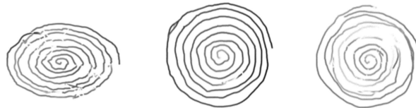
Figure 5. AD hybrid spiral images embedding pointwise pressure values in grayscale. Low and high-pressure levels on pen-down trajectories are displayed from white to black, respectively.