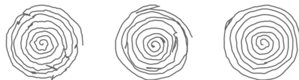
Figure 3. AD raw (pen-down) spiral trajectory images generated from coordinate sequences.