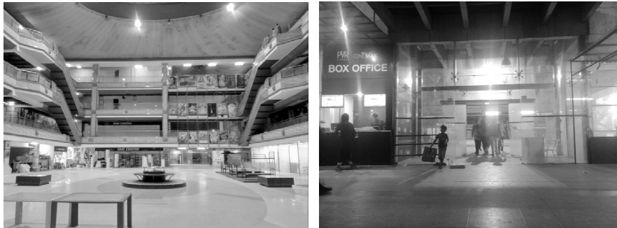
Figure 3 – In the Dev Arc mall and R3 mall in Ahmedabad, only multiplexes (movie theatres) have found their public.

investors, and promoters, admittedly failed to adapt the content of their offer to complex local demands due to poor “market research” and “positioning strategies”, which revealed a lack of understanding of consumer motivations [Suresh 2013].