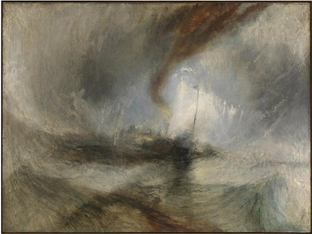
Fig. 6: Joseph Mallord William Turner, Snow Storm – Steam-Boat off a Harbour's Mouth , exhibited 1842, oil paint on canvas, support: 914 × 1219 mm, frame: 1233 × 1535 × 145 mm, © Tate Britain, London, Photo © Tate, CC-BY-NC-ND 3.0

< https://www.tate.org.uk/art/artworks/turner-snow-storm-steam-boat-off-a-harbours-mouth-n00530 >