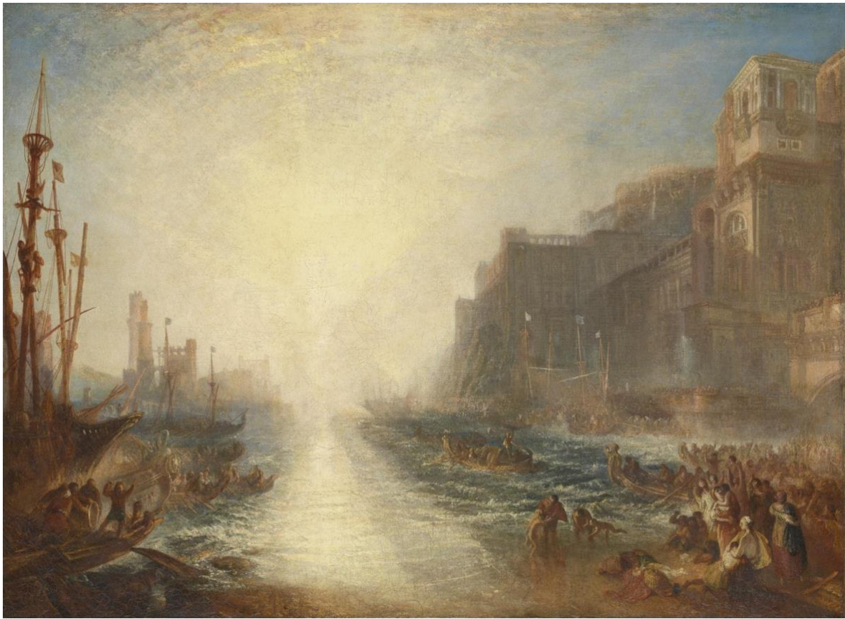
Fig. 7: Joseph Mallord William Turner, Regulus , 1828 reworked 1837, oil paint on canvas, support: 895 × 1238 mm, frame: 1135 × 1460 × 93 mm, © Tate Britain, London

< https://www.tate.org.uk/art/artworks/turner-regulus-n00519 >