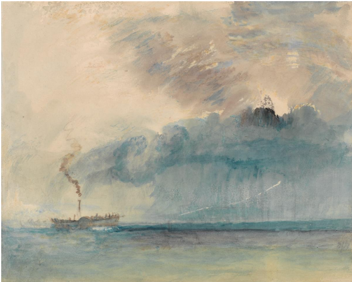
Fig 1: Joseph Mallord William Turner, A Paddle-steamer in a Storm , ca. 1841, Watercolor, graphite and scratching out on medium, slightly textured, cream wove paper, Yale Center for British Art, New Haven.