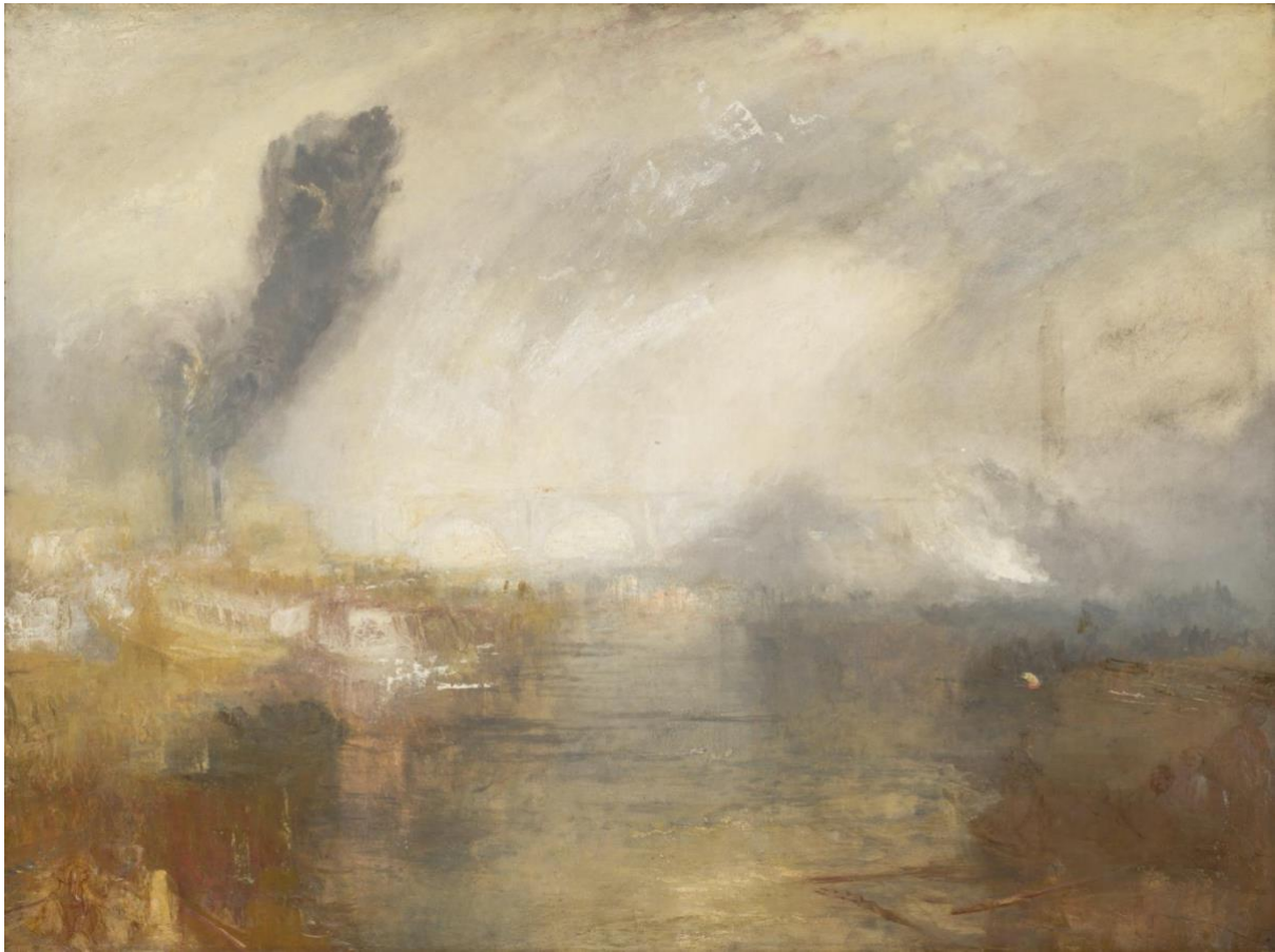
Fig. 5: Joseph Mallord William Turner, The Thames above Waterloo Bridge , c.1830–5, oil paint on canvas, support: 905 × 1210 mm, frame: 1138 × 1457 × 82 mm, © Tate Britain, London, Photo © Tate, CC-BY-NC-ND 3.0

< https://www.tate.org.uk/art/artworks/turner-the-thames-above-waterloo-bridge-n01992 >