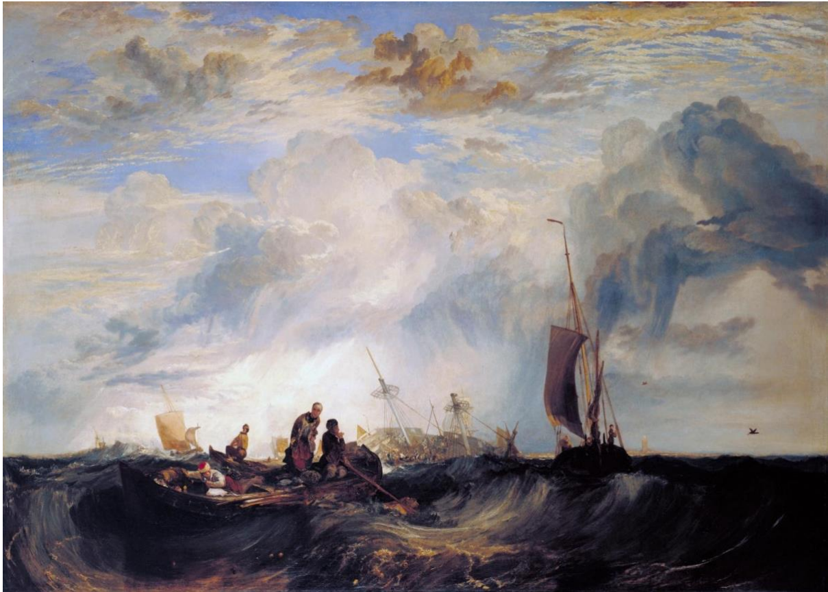
Fig. 4: Joseph Mallord William Turner, Entrance of the Meuse: Orange-Merchant on the Bar, Going to Pieces; Brill Church bearing S. E. by S., Masensluys E. by S. , exhibited 1819, oil paint on canvas, support: 1753 × 2464 mm, frame: 2110 × 2820 × 140 mm, © Tate Britain, London, Photo © Tate, CC-BY-NC-ND 3.0

< https://www.tate.org.uk/art/artworks/turner-entrance-of-the-meuse-orange-merchant-on-the-bar-going-to-pieces-brill-church-n00501 >