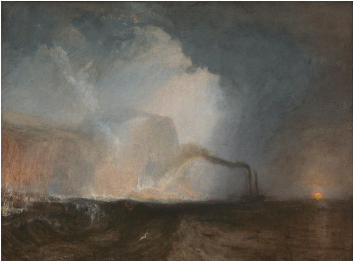
Fig. 2: Joseph Mallord William Turner, Staffa, Fingal's Cave , ca. 1831–32, oil on canvas, Yale Center for British Art, New Haven.

< https://collections.britishart.yale.edu/catalog/tms:5018 >