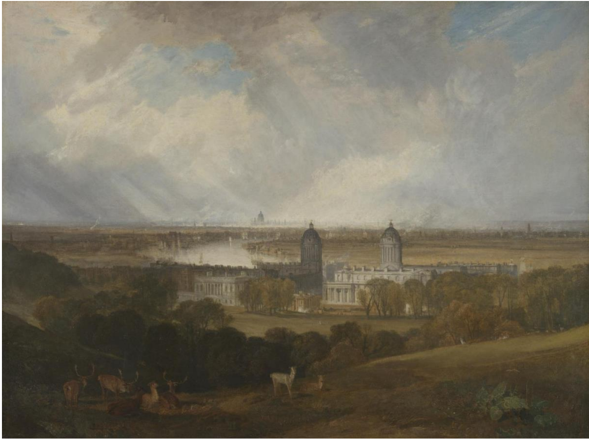
Fig. 3: Joseph Mallord William Turner, London from Greenwich Park , oil paint on canvas, support: 902 × 1200 mm, frame: 1285 × 1584 × 155 mm, © Tate Britain, London, Photo © Tate, CC-BY-NC-ND 3.0

< https://www.tate.org.uk/art/artworks/turner-london-from-greenwich-park-n00483 >