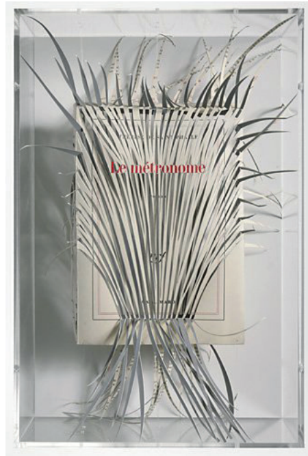
Fig. 3. Georgia Russell, Le Métronome , 2008, By courtesy of the artist. © Georgia Russell