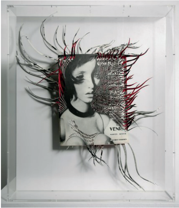
Fig. 2. Georgia Russell, Les Cahiers Obscurs , 2009, By courtesy of the artist. © Georgia Russell