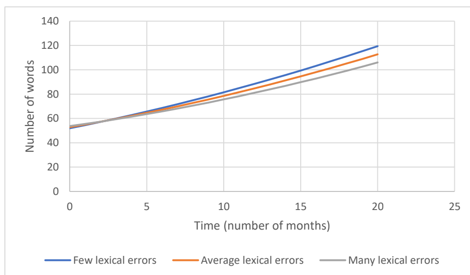
Figure 1. Text length as a function of time and lexical errors.