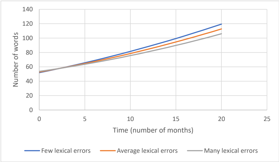
Figure 1. Text length as a function of time and lexical errors.