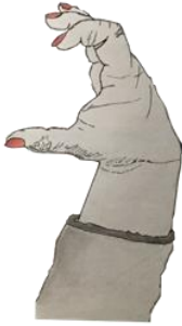
Figure 2. Iconic hand gesture

This gesture is held for about 1.9 seconds.