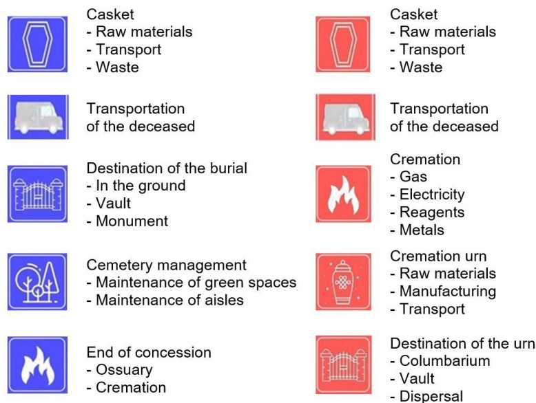
Figure 1. Cremation vs. burial funeral service: two value chains

The specific objective of the research note is to stimulate academic debate on the ecological stakes of the choices that individuals are led to make in the organization of funeral service. For a long time, the question of the parsimonious use of resources related to funeral rites has been neglected, voluntarily or involuntarily. The cultural and religious dimensions were considered essential, and it was important to analyze how different peoples proceeded with their dead. A new and very recent stream of research is developing to approach the funeral service from a different angle: the comparison between the two main value chains, cremation and burial. By value chain , we mean all the interdependent activities that are linked together to produce a good or service. Figure 1 provides a simplified representation of the two value chains discussed in the research note, and whose differentiated environmental impacts are to be assessed under the constraint of religious dimensions. The box devoted to the methodology specifies the key elements relating to data collection.