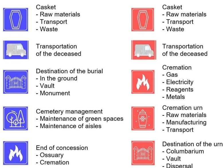
Figure 1. Cremation vs. burial funeral service: two value chains Source: Adapted from Toutain Meusnier and Ho [28].

The specific objective of the research note is to stimulate academic debate on the ecological stakes of the choices that individuals are led to make in the organization of funeral service. For a long time, the question of the parsimonious use of resources related to funeral rites has been neglected, voluntarily or involuntarily. The cultural and religious dimensions were considered essential, and it was important to analyze how different peoples proceeded with their dead. A new and very recent stream of research is developing to approach the funeral service from a different angle: the comparison between the two main value chains, cremation and burial. By value chain , we mean all the interdependent activities that are linked together to produce a good or service. Figure 1 provides a simplified representation of the two value chains discussed in the research note, and whose differentiated environmental impacts are to be assessed under the constraint of religious dimensions. The box devoted to the methodology specifies the key elements relating to data collection.