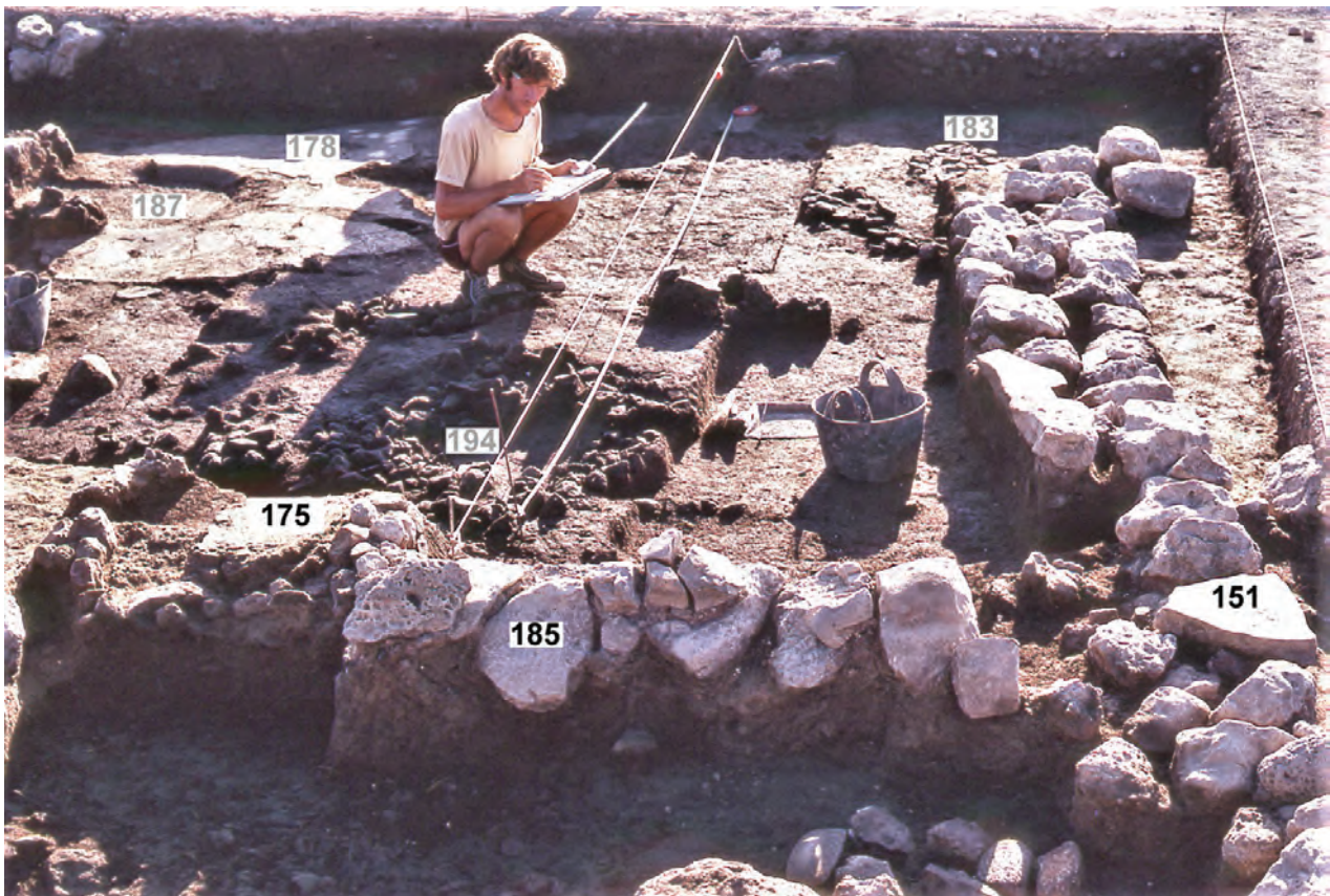
Fig. 9.6: Photograph of the ongoing excavation taken from the west. The base of wall 185 is high in the stratigraphy and reveals that the partitioning of the structure into two distinct spaces, the main room and the annex room, belongs to a late phase of the construction. In the foreground, notice the deposit of axes and grinding material. In the background, Daniel Ladiray is drawing the plan of Structure 194 (Photographic credits: Archives of the Maison des Sciences de l'Homme Mondes, mission Beisamoun).

Locus 197 (from 68.95 to 68.90 m) was found at the same level, between platform 182 and the stone alignment adjoining the two plastered skulls (locus 180). The bones of four newborns were unearthed there (Fig. 9.1 and Lechevallier 1978: Plate XXX-3). One of them was found in perfect anatomical connection in the grave buried on its right side, with the lower limbs bent perpendicularly to the axis of the body and the left upper limb extended. Two other immature skulls can be discerned facing this first skeleton, with a third outlined about 50 cm from there, below the stone against which the plastered skull 1 was found. Given the distance between these four children, it is unlikely that they were in the same grave. The secondary nature of three of these deposits also remains very hypothetical as anthropologists describe infracranial remains for all of these newborns, including long bones, pelvic bones, and “miscellaneous debris” (Ferembach and Solivérès 1978: 182). Moreover, skull bones are not fused at this age and their relocation would necessarily have led to their disruption, but according to plans and photos, this is not the case.