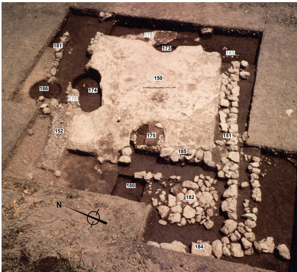
Fig. 9.2: Photograph of structure 150 taken from the west. Level 1 is being excavated, the antechamber is not yet fully exposed. Note, next to the section, the negative square left by the removal block of the two plastered skulls (locus 180) (Photographic credits: Archives of the Maison des Sciences de l'Homme Mondes, mission Beisamoun).

Two symmetrical post holes were discovered (loci 189 and 190) under the plastered floor (level 1) (Fig. 9.1). They are part of an earlier phase of occupation during which the floor could have been made of rammed earth (level 2). Two hearths (loci 193, 194) and a stone basin (locus 183) could also belong to this settlement phase. Even lower still (level 3), directly on the virgin ground, remnants of the plastered floor were preserved over 7 m 2 (locus 178), associated with a large twice-limed basin (locus 187). At the very top of the stratigraphy, four pits were dug out in level 1, attesting to a now completely levelled out later Neolithic period (double pit 174 and pits 173 and 186) (Figs. 9.1 and 9.2). We would need to examine the material filling these pits in order to propose a reliable chronological attribution.