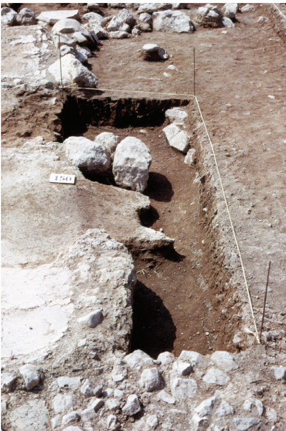
Fig. 9.4: Detail of the passage between the antechamber and the main room located 30 cm above in its final state. Photographed from the north (Photographic credits: Archives of the Maison des Sciences de l'Homme Mondes, mission Beisamoun).