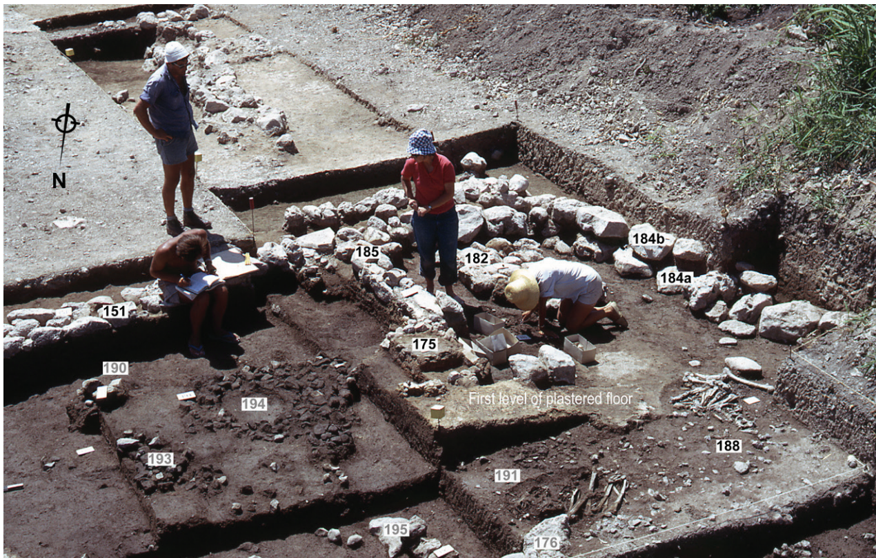
Fig. 9.5: Photograph of the ongoing excavation taken from the northeast. The upper levels of plastered floor have been removed. Note the remnant of the earliest plastered floor preserved beyond the passage sloping gently down to the antechamber. The difference in height between the two rooms is minor compared to what was observed at the beginning of the excavation (cf. Fig. 9.4). Note the two grave loci 191 and 188 being exposed. Denise Ferembach (standing) and Geneviève Dollfus are digging locus 197.

not mentioned in the publication but clearly identified by the excavators at the junction between the main room and the adjoining room (Fig. 9.5). The 30 cm step separating these two spaces on the upper level did not yet exist at this early occupation level. Instead, the plaster continues with a slight slope towards the adjoining room (at 69.00 m). A floor level is noted, without any further precision, at the same height (68.97 m), immediately below pavement 182. Therefore, we can wonder whether this ‘pavement’ is not rather a raised platform contemporaneous with the earliest floor. Especially considering that abundant grinding equipment was discovered at its base, as well as on its slabs (Figs. 9.6 and 9.7).