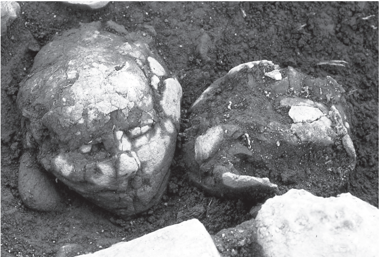
Fig. 9.8: Plastered skulls 1 and 2 in situ (Photographic credits: Archives of the Maison des Sciences de l'Homme Mondes, mission Beisamoun).

Locus 180 designates the deposit of the two plastered skulls. In the field, only one of the two was identified as such, as the second one is very damaged. They were found while the excavation of the antechamber was just beginning and they were removed almost immediately. There are very few field notes to describe them further. The dismantling of the skulls was filmed, but we have not yet been able to view this film, which would have to be digitized beforehand. The skulls were placed one against the other (Figs. 9.7 and 9.8). Skull 1 was looking eastwards, perfectly centered in relation to the axis of the large hearth (locus 175), wedged in this position by a pebble. Skull 2 was positioned perpendicularly, facing south, in the direction of skull 1. Nearby, but a little higher up, a horizontally placed tibia and two adult cervical vertebrae were found immediately under the alignment of stones to the east of the skulls (Figs. 9.1 and 9.7). The two skulls were found lower than the base of this alignment, at a height noted at approximately 69.00 m, which is identical to the floor remnants found later near the threshold and under the platform.