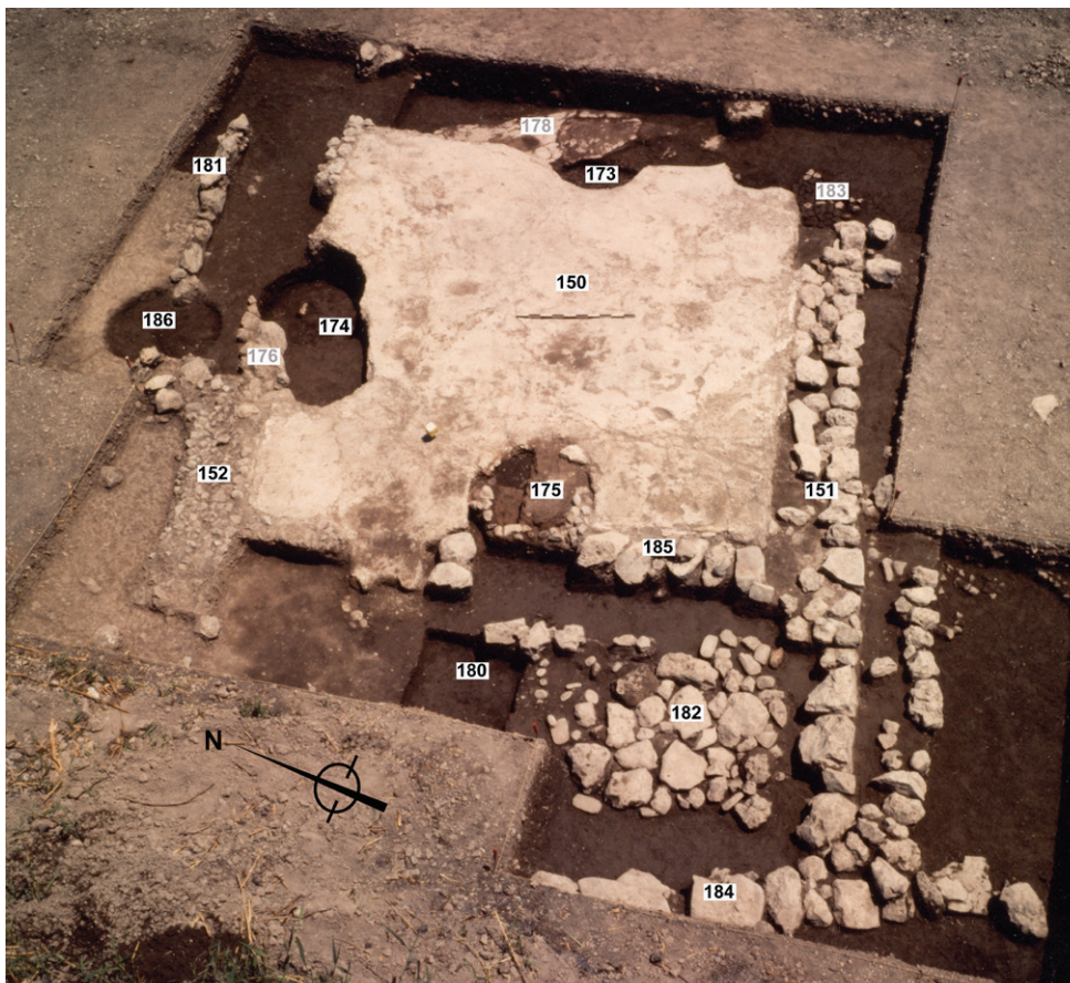
Fig. 9.2: Photograph of structure 150 taken from the west. Level 1 is being excavated, the antechamber is not yet fully exposed. Note, next to the section, the negative square left by the removal block of the two plastered skulls (locus 180) (Photographic credits: Archives of the Maison des Sciences de l'Homme Mondes, mission Beisamoun).

Two symmetrical post holes were discovered (loci 189 and 190) under the plastered floor (level 1) (Fig. 9.1). They are part of an earlier phase of occupation during which the floor could have been made of rammed earth (level 2). Two hearths (loci 193, 194) and a stone basin (locus 183) could also belong to this settlement phase. Even lower still (level 3), directly on the virgin ground, remnants of the plastered floor were preserved over 7 m 2 (locus 178), associated with a large twice-limed basin (locus 187). At the very top of the stratigraphy, four pits were dug out in level 1, attesting to a now completely levelled out later Neolithic period (double pit 174 and pits 173 and 186) (Figs. 9.1 and 9.2). We would need to examine the material filling these pits in order to propose a reliable chronological attribution.