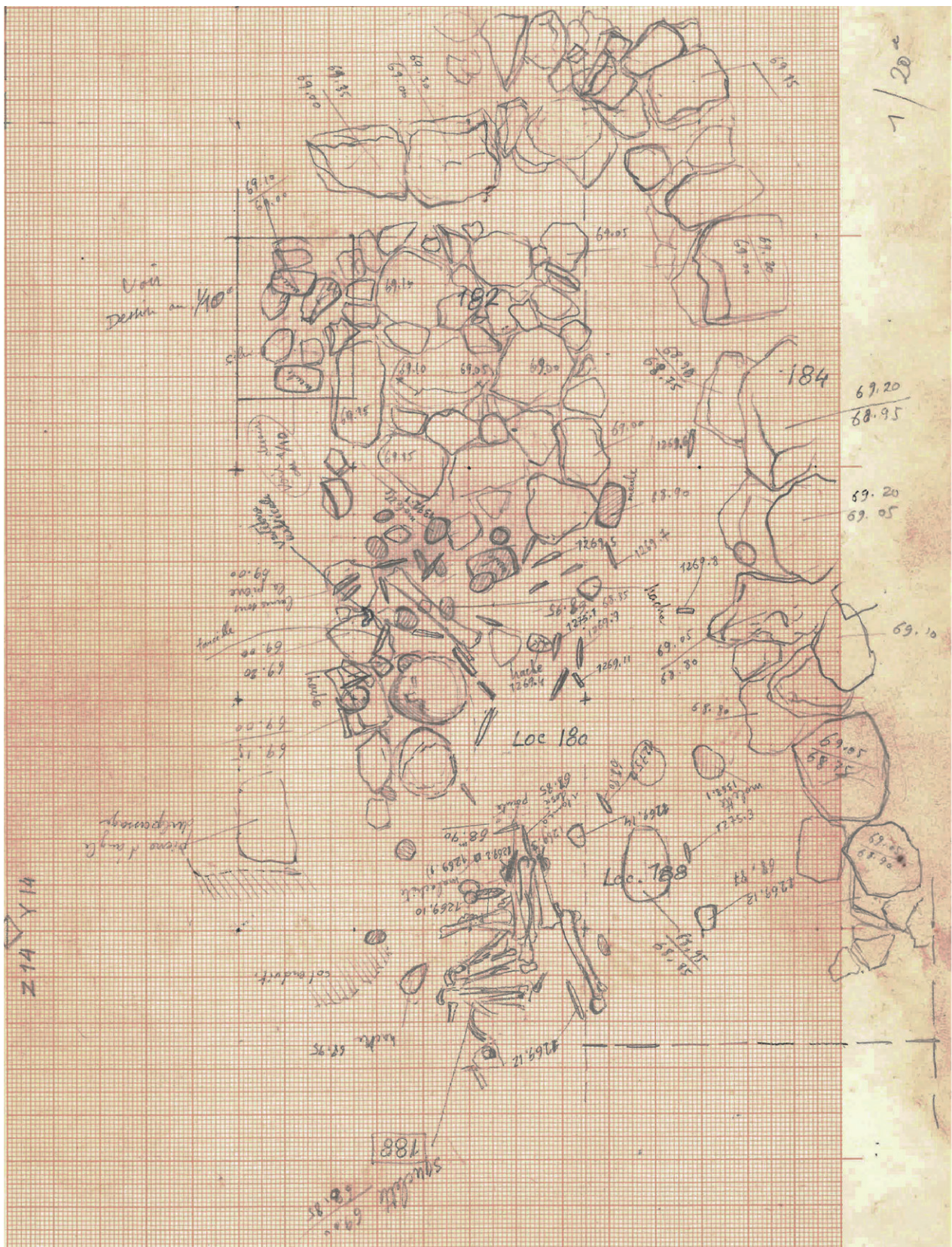
Fig. 9.7: 1:20 scale drawing of loci and scattered items found in the antechamber.