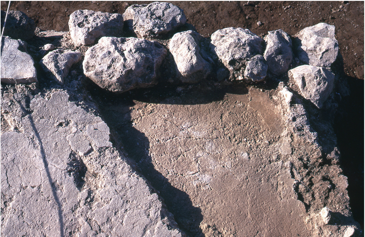
Fig. 9.3: Two levels of thick and well-preserved plastered floor exposed in the northeast corner of the main room (Photographic credits: Archives of the Maison des Sciences de l'Homme Mondes, mission Beisamoun).