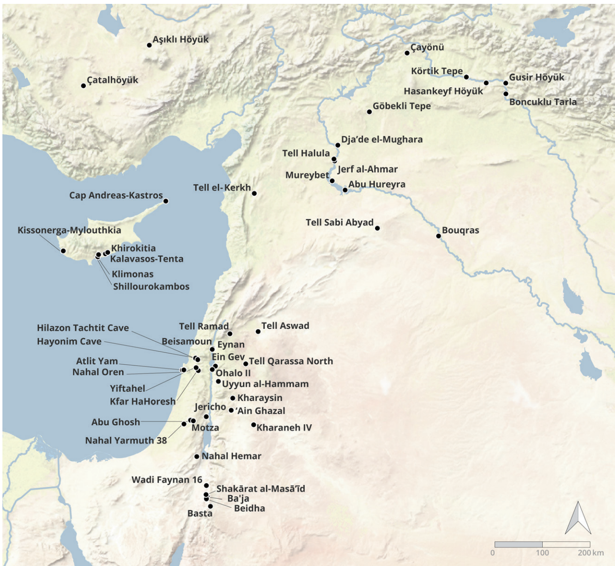
Map of sites mentioned in this volume.