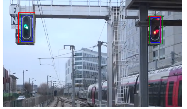
Figure 2: Bounding boxes as predicted by the ML predictor (blue), their conformalized version with additive scores (green) and the ground truth (red). Example of images used in conformalization and testing, cropped for readability.

We evaluate OD performances (Table 3) by box-wise conformal prediction, reporting the estimated quantiles q_{1-\frac{\alpha}{4}}^c at the desired risk level. A higher quantile reveals a higher uncertainty of OD predictions. In order to compare additive and