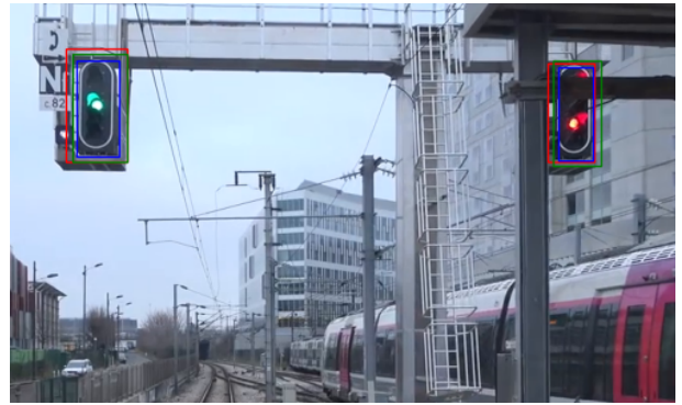
Figure 2: Bounding boxes as predicted by the ML predictor (blue), their conformalized version with additive scores (green) and the ground truth (red). Example of images used in conformalization and testing, cropped for readability.

We evaluate OD performances (Table 3) by box-wise conformal prediction, reporting the estimated quantiles q_{1-\frac{\alpha}{4}}^c at the desired risk level. A higher quantile reveals a higher uncertainty of OD predictions. In order to compare additive and