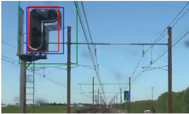
Figure 3: Bounding boxes as predicted by the ML predictor (blue), their conformalized version with multiplicative scores (green) and the ground truth (red). Example of images used in conformalization and testing, cropped for readability.

tional: our ML pipeline could rely on a conservative estimation of the ground-truth to carry out a control operations (e.g. running a ML subcomponent on the detection area).