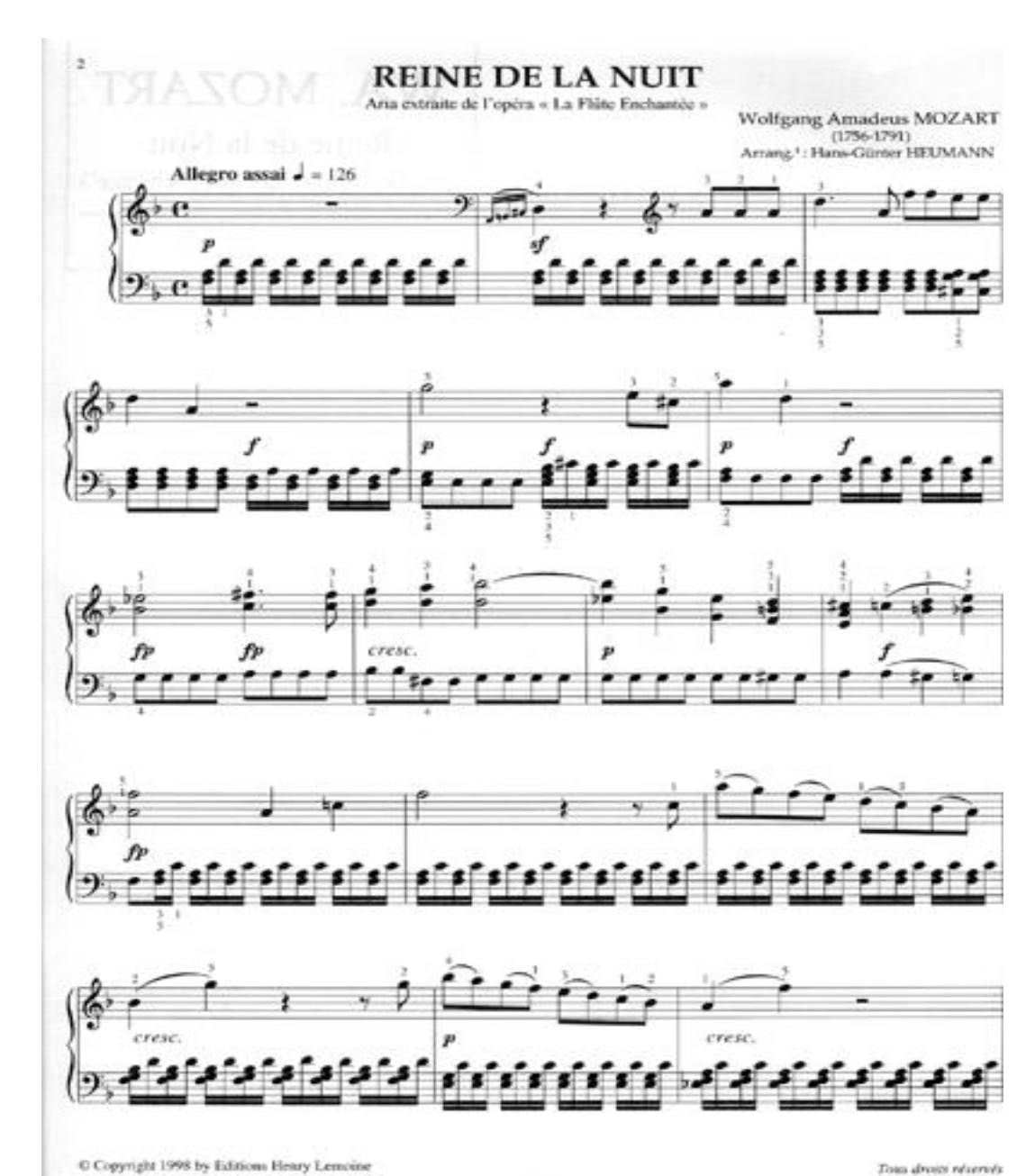
Scores of the musical works to which the students have listened