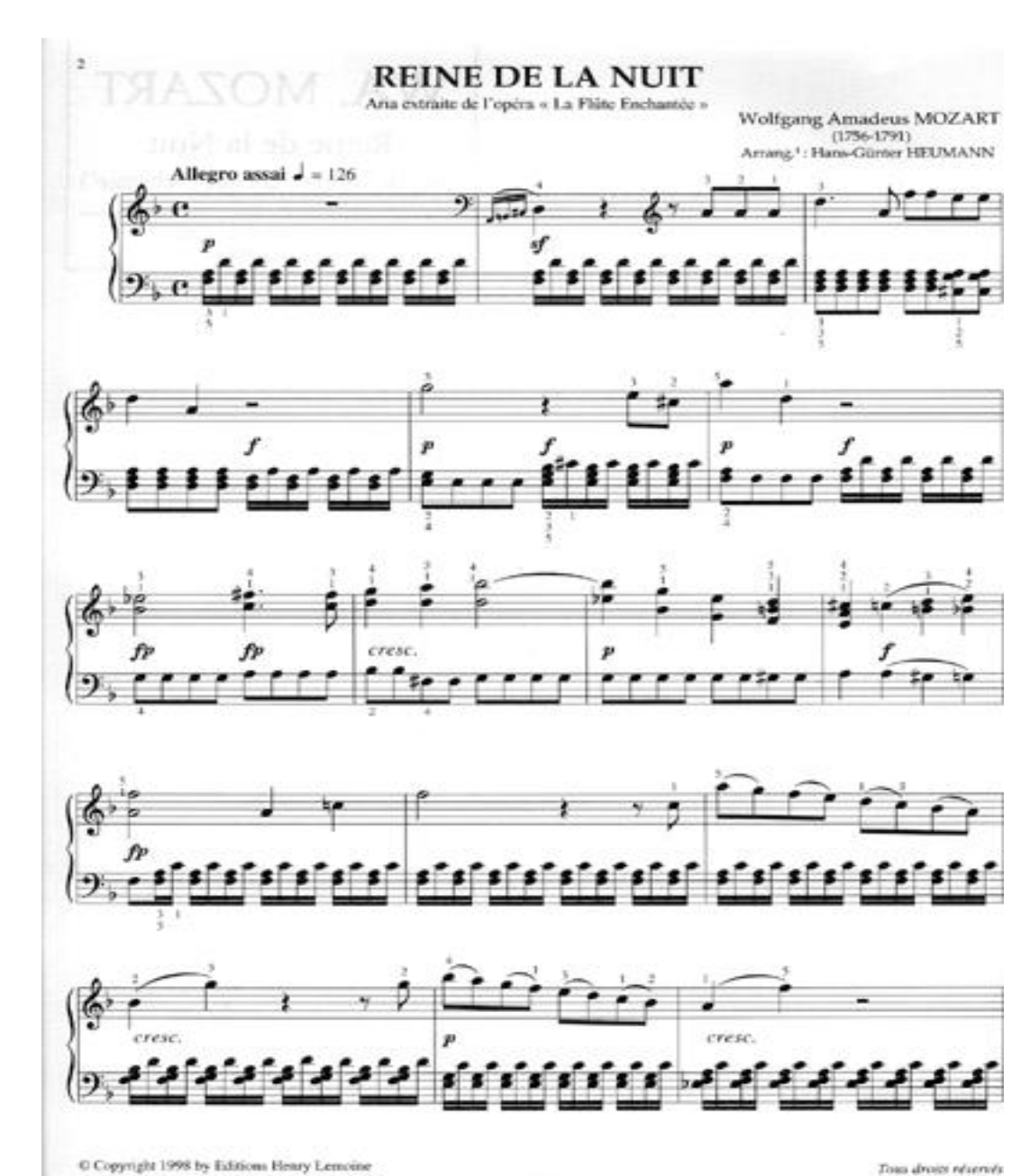
Scores of the musical works to which the students have listened