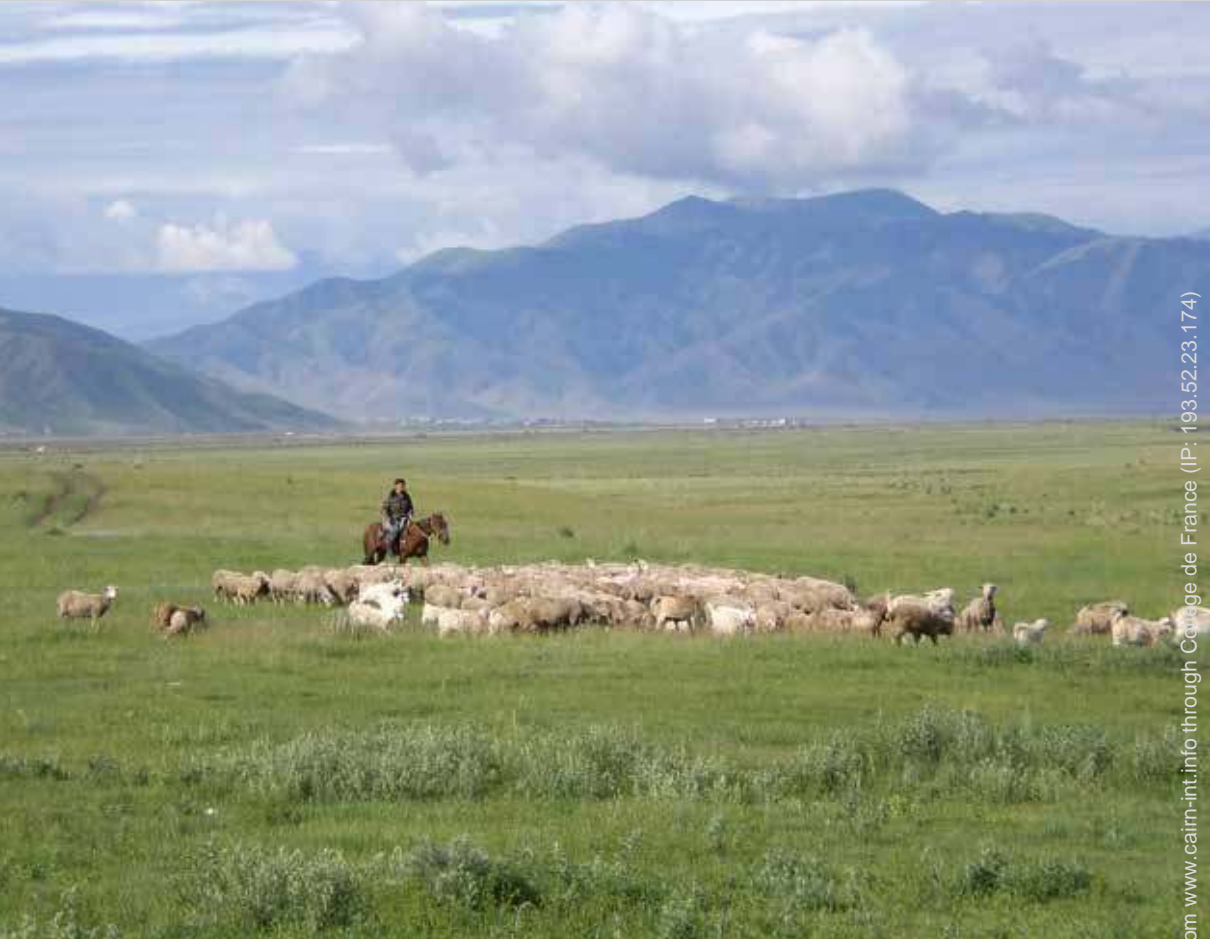
Hered by a shepherd on horseback, sheep graze in a summer pasture dotted with flowers (Kazakhstan, Almaty region, Raiymbek district, June 2012).