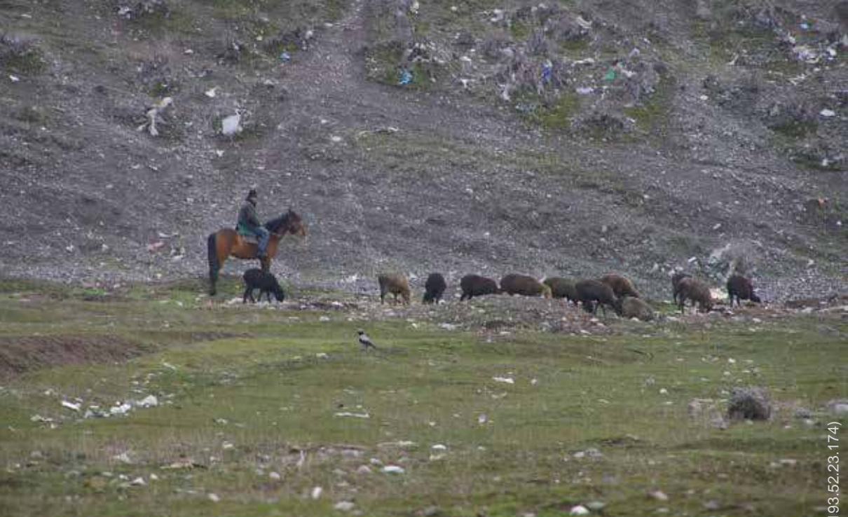
Herded by a shepherd on horseback, sheep graze on radioactive waste dump near a former uranium processing facility in Kara-Balta (Kyrgyzstan, Chui region, Zhaiyl district, February 2009).