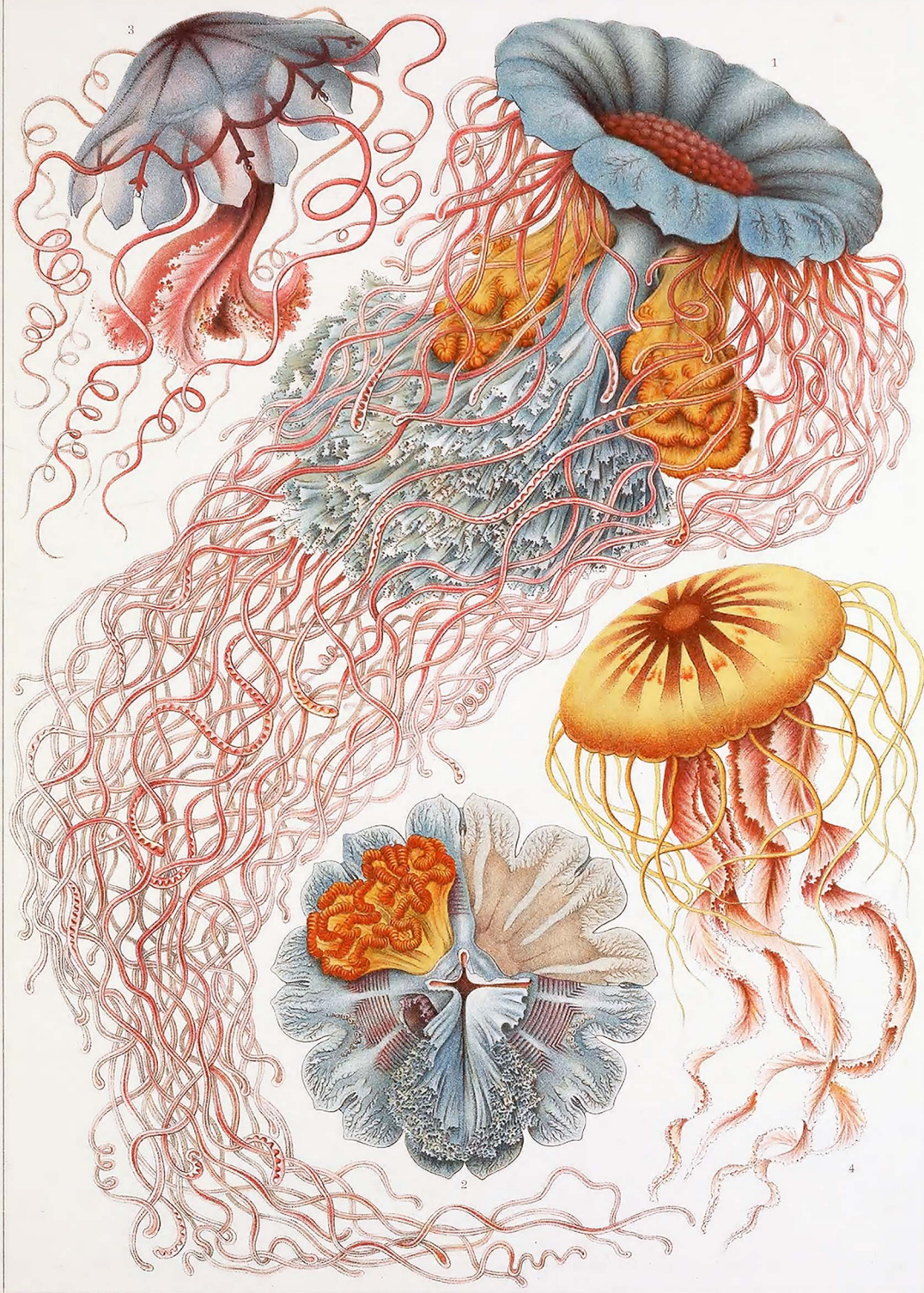
Discomedusae. — Scheibenquallen.