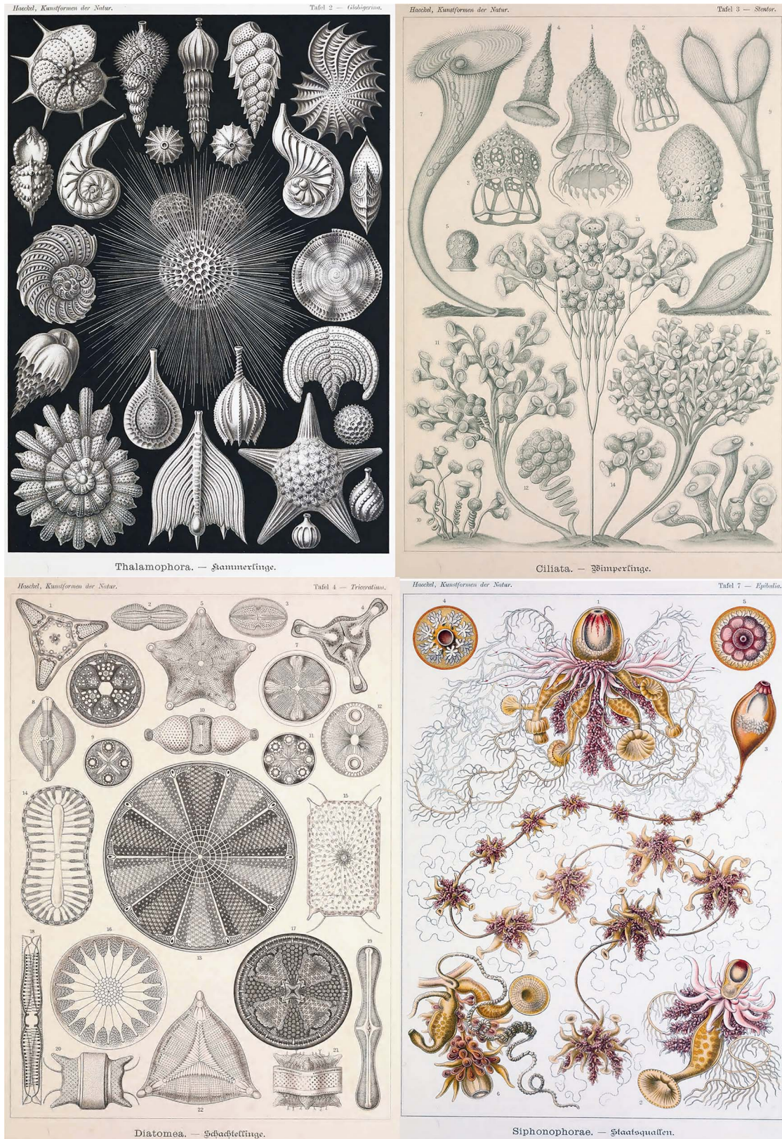
Fig. 2. Plates 2, 3, 4 and 7 showing the beauty of foraminifera, ciliates, diatoms and siphonophores.