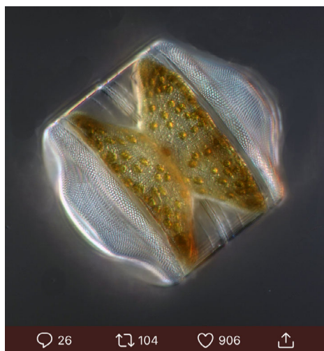
FIG. 1. The Antarctic diatom tweet got over 900 “likes” in about 24 h.

This is the story of a tweet that went wild and that perhaps has a lesson for outreach. In mid-May, I started working on samples of