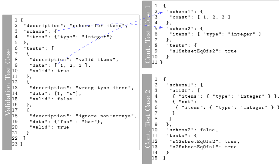
Fig. 2. Left: Test case from the JSON Schema Test Suite [12] for testing JSON Schema validators (for Draft 6, adapted from file items.json , commit hash #fe94275 ). Right: Derived test cases for JSON Schema containment. Dashed arrows indicate data flow.

JSON Schema Containment. In the following, we write S \subseteq S' to denote that schema S is contained in S' , meaning that any JSON instance valid w.r.t. S is also valid w.r.t. S' . We write S \equiv S' to denote schema equivalence, which can be checked by double inclusion. While JSON Schema validation can be checked in polynomial time, containment checking results to be EXPTIME-hard [6].