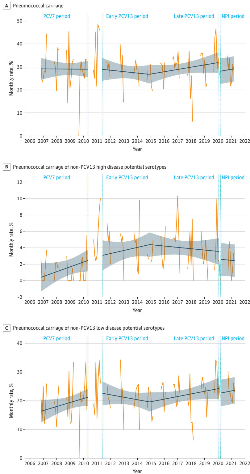
Figure 2. Association of Nonpharmaceutical Intervention (NPI) Implementation With Pneumococcal Carriage in Healthy Children

A total of 6831 children were healthy during the study period. The 7-valent pneumococcal conjugate vaccine (PCV7) period was from January 1, 2007, to May 31, 2010; the early 13-valent PCV (PCV13) period, June 1, 2011, to May 31, 2014; the late PCV13 period, June 1, 2014, to February 29, 2020; and the NPI period, April 1, 2020, to March 31, 2021. The blue slope lines were estimated using a segmented regression model. The shaded areas show the 95% CIs estimated using the segmented regression model. The vertical dotted lines show the transition period from PCV13 implementation (April 1, 2010, to May 31, 2011) to NPI implementation (March 1-31, 2020). A, A total of 2013 children were included in the analysis. B, Pneumococcal carriage rates of non-PCV13 serotypes with high disease potential (including serotypes 8, 10A, 12F, 22F, 24F, 33F, and 38). A total of 225 children were included in the analysis. C, Pneumococcal carriage rates of non-PCV13 serotypes with low disease potential (including serotypes 6C, 11A, 15A, 15B/C, 17F, 19F, 21, 23A, 23B, 31, 34, 35B, 35F, and nontypeable). A total of 1455 children were included in the analysis.