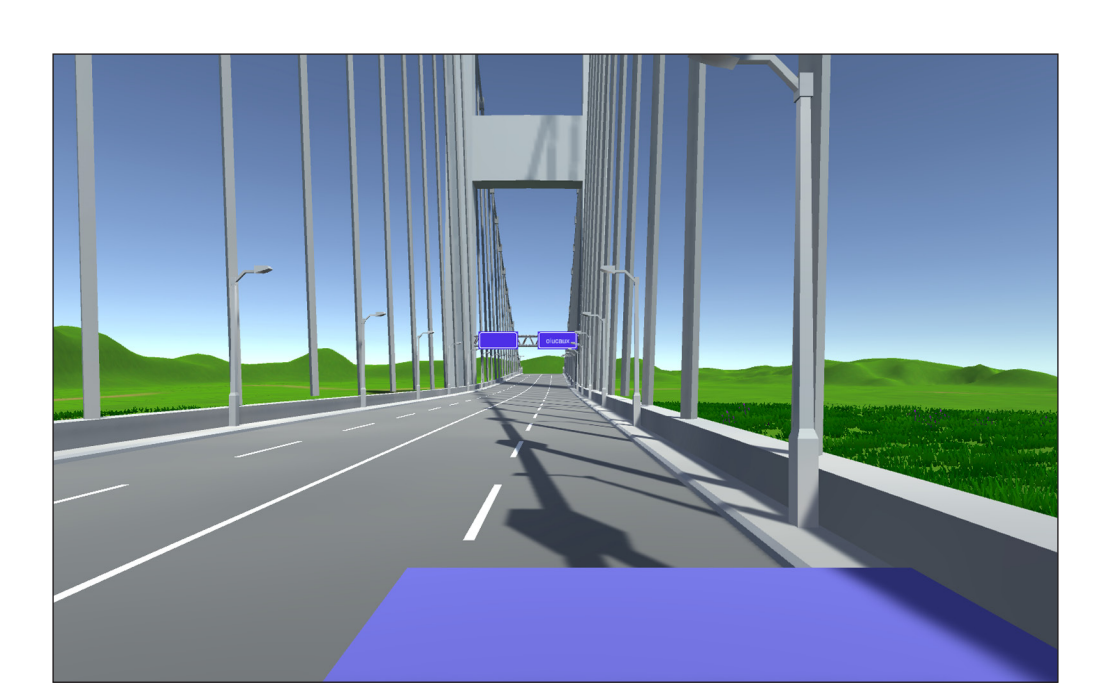
Mirault and Grainger Journal of Cognition DOI: 10.5334/joc.160