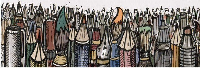
Figure 2: Illustration of pens, pencils and paintbrushes, pen and paper, digital colouring, Miriam Sturdee, 2021

'22 Extended Abstracts), April 29-May 5, 2022, New Orleans, LA, USA. ACM, New York, NY, USA, 6 pages. https://doi.org/10.1145/3491101.3503722