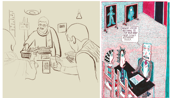
Figure 4: Left: A road-side merchant using digital payments for daily transactions, Digital illustration, Pranjal Jain, 2021; Right: We Hate You, Enormous Leering Skull (excerpt), Ink on Paper, John Miers, 2019 [8]. ©All artworks in this montage belong to the authors and are reproduced with permission.

Immediately after the workshop finishes we plan to host a small exhibition in an appropriate area within the conference venue (in conversation with the workshop and general chairs). The workshop organisers will request the use of a small number of poster-boards to facilitate presentation. This in-CHI exhibition can be hosted both within the physical venue and digital space for all attendees to explore. When the physical imagery is removed, the online exhibition (hosted in Mozilla Hubs) will remain as a legacy of the event. We also plan to form a working group and network whose aims are to raise awareness of the complementary and investigative nature of arts practice, and produce outputs that challenge existing publication genres. Finally, we will create a digital/physical artists' book in the style of a gallery catalogue – de-centering text and celebrating the artists' creation from the workshop. This will be made open access and available for download and print.