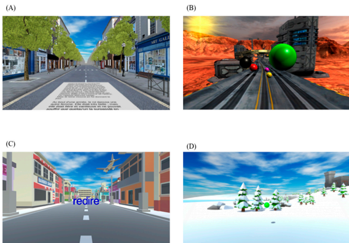
Figure 2. Example of MoveR exercises elicited: (A) Read in motion; (B) Battle race; (C) Jump in words; (D) Vergence movements.

Read in Motion (Figure 2A): In an urban environment, a child is invited to read a text, which scrolls on the road. The therapist can play on all the kinetic parameters, as well as on the representation of the displayed reading page (text, font, inclination, colors, and transparency). The reading speed as well as the accuracy is measured. This exercise reinforces visual discrimination and visual-attentional span, and promotes focal visual attention by limiting the overall perception of the word.