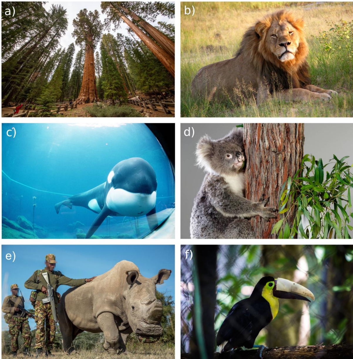
Figure 2. Examples of flagship individuals. (a) General Sherman, a giant sequoia ( Sequoiadendron giganteum ) in California, believed to be the world’s largest known living single-stem tree; (b) Cecil the lion ( Panthera leo ), whose killing by a trophy hunter in Zimbabwe provoked global condemnation; (c) Keiko, a captive orca ( Orcinus orca ), who starred in the movie Free Willy; (d) taxidermied mount of Sam, a female koala ( Phascolarctos cinereus ), who attracted global attention to bushfire impacts in Australia; (e) Sudan, a captive northern white rhinoceros ( Ceratotherium simum cottoni ) and the last known male of the subspecies

al. 2018; Courchamp et al. 2018). Moreover, individuals with recognized flagship potential (WebTables 1–4) are more often than not large, terrestrial mammals, taxa that were frequently identified as being the “most charismatic” by Albert et al. (2018).