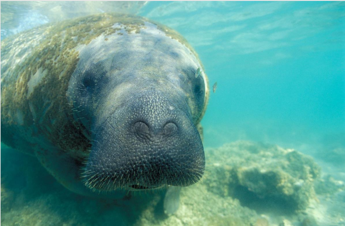
Figure 3. Lua the Antillean manatee ( Trichechus manatus manatus ).

At the time of writing, Lua is a middle-aged (a 31 year-old) manatee of around 3.1 m length and 640 kg weight. Her body size and unique features, including an “algae mask” on her face, make her easily recognizable and facilitate tracking, and due to her friendly disposition toward humans she remains one of the most important conservation assets on the northeastern coast of Brazil.