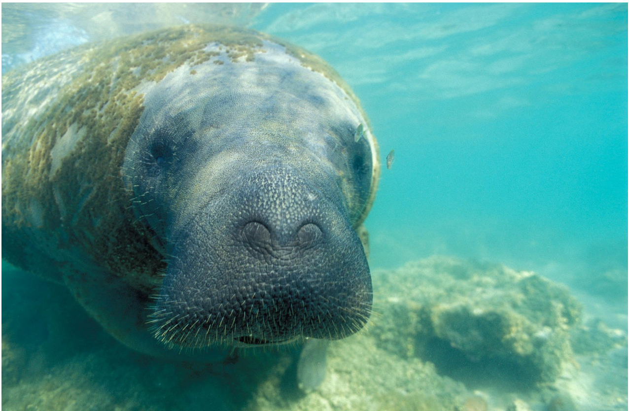
Figure 3. Lua the Antillean manatee ( Trichechus manatus manatus ).

At the time of writing, Lua is a middle-aged (31 years old) manatee of around 3.1 m length and 640 kg weight. Her body size and unique features, including an 'algae mask' on the face, make her easy to recognize and track, and her friendly disposition towards humans means she remains one of the most important conservation assets on the northeast coast of Brazil.