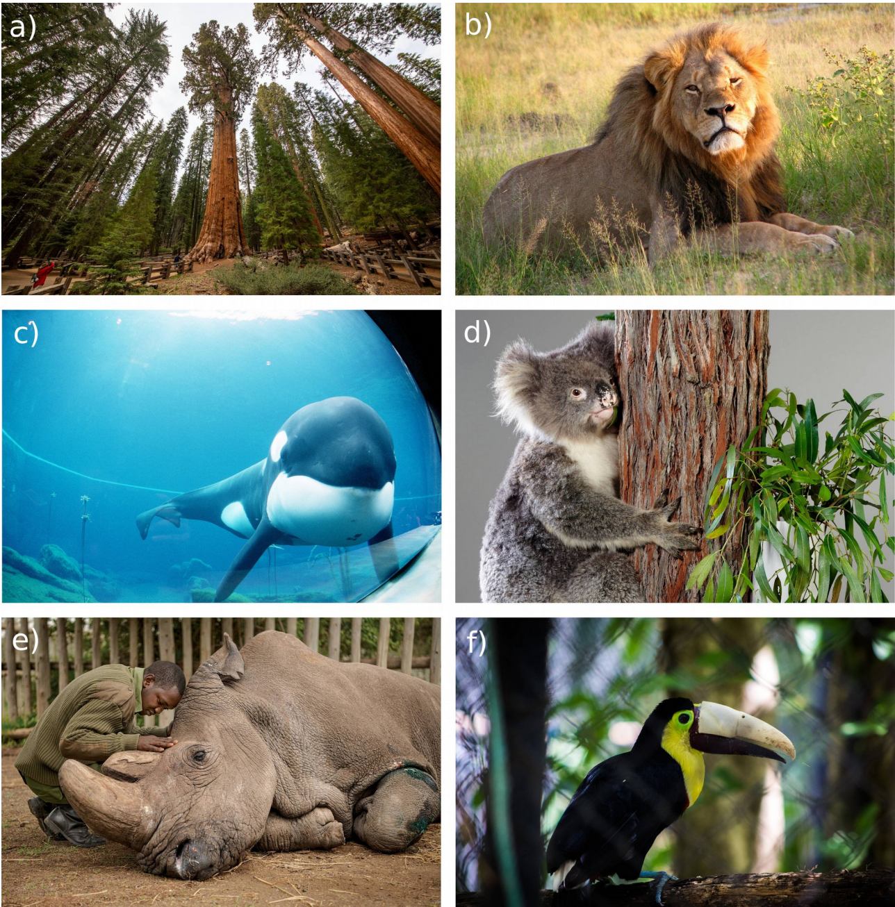
Figure 2. Examples of flagship individuals. (a) General Sherman, a giant sequoia, the world largest known living single-stem tree; (b) Cecil the Lion, whose killing by a trophy hunter drew global condemnation; (c) Keiko, a captive orca who starred in the movie Free Willy ; (d) Sam, a female koala who attracted global attention to bushfire impacts; (e) Sudan, a captive northern white rhinoceros who was the last known male of the species; (f) Grecia, a chestnut-mandibled toucan, victim of abuse, inspired public activism and policy change. More information in WebPanel 1.

Flagship individuals also tend to be very exposed to humans, for example in protected areas that are popular tourist destinations, or in urban areas (eg Ruthi the striped hyena, Hyaena hyaena ; WebTables 1-4). Furthermore, they may have high levels of direct human interaction, for example as zoo attractions (eg Tilikum, a captive killer whale, Orcinus orca , kept at SeaWorld Orlando), or by having become so habituated to people that they tend to approach them (eg Lua the Antillean manatee, Trichechus manatus manatus ; Panel 1). Such visibility can be further strengthened