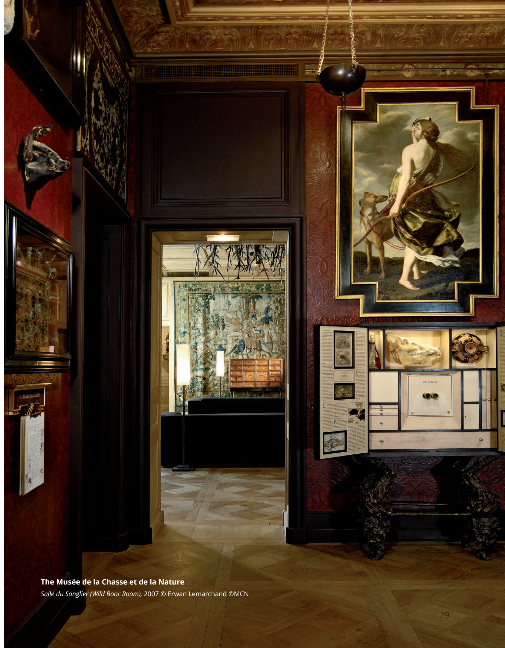
The Musée de la Chasse et de la Nature