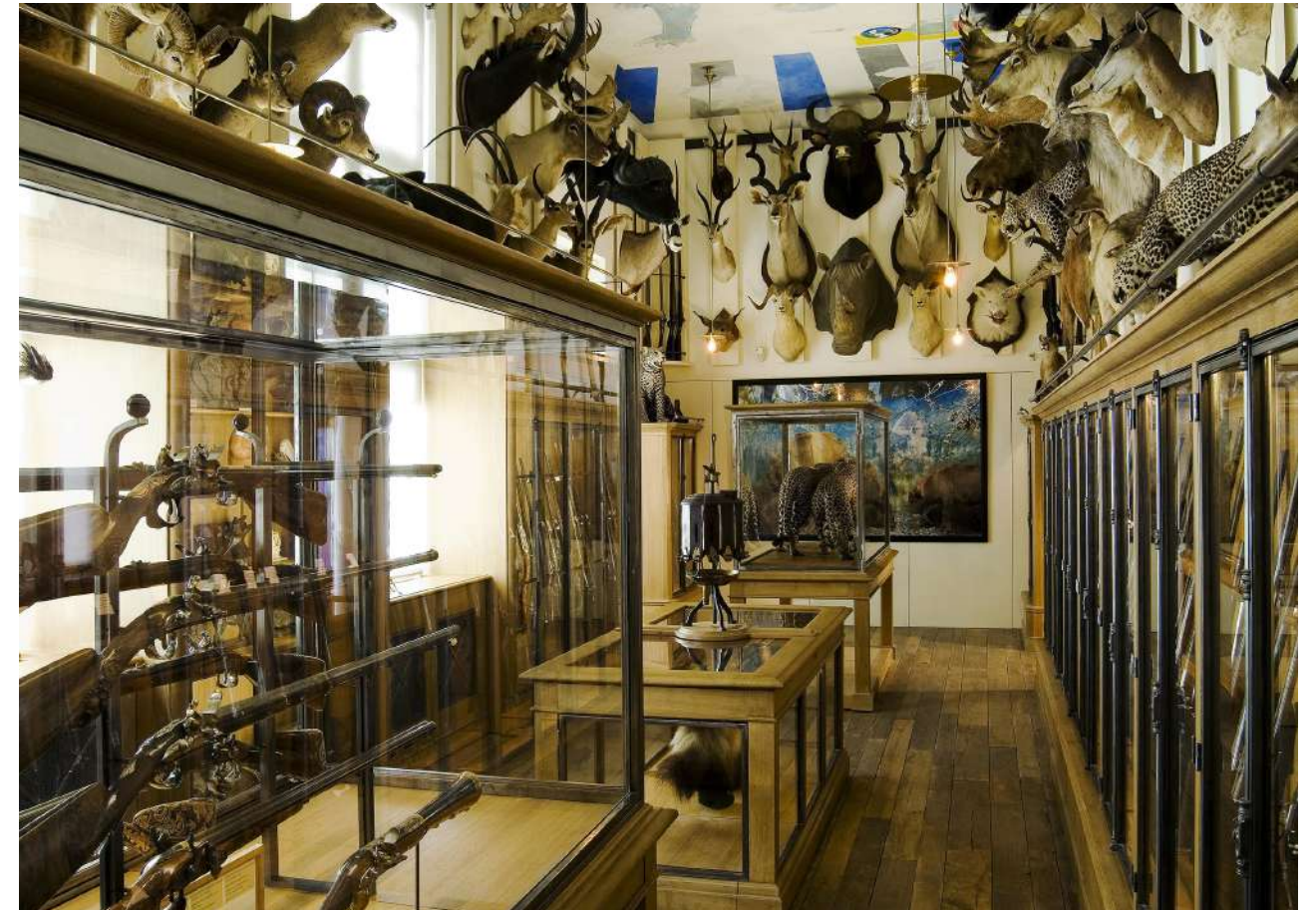
The Musée de la Chasse et de la Nature

As such, the works presented retrace both a history of techniques and a history of representations. The museum displays an immense collection of hunting trophies, tools and weapons of multiple styles and epochs, and a great diversity of objects related to the history of hunting — such as a collection of 18 th century zoomorphic terrines or a series of precious dog collars. Added to (and often intertwined with) this cultural history of the evolution of hunting practices and the folklore surrounding them is an itinerary through hunting mythology, starting with the intimate “Cabinet de Diane”, that pays special tribute to the hunting and nature goddess Diana, housing two paintings by Pierre Paul Rubens and Jan I Brueghel. 4