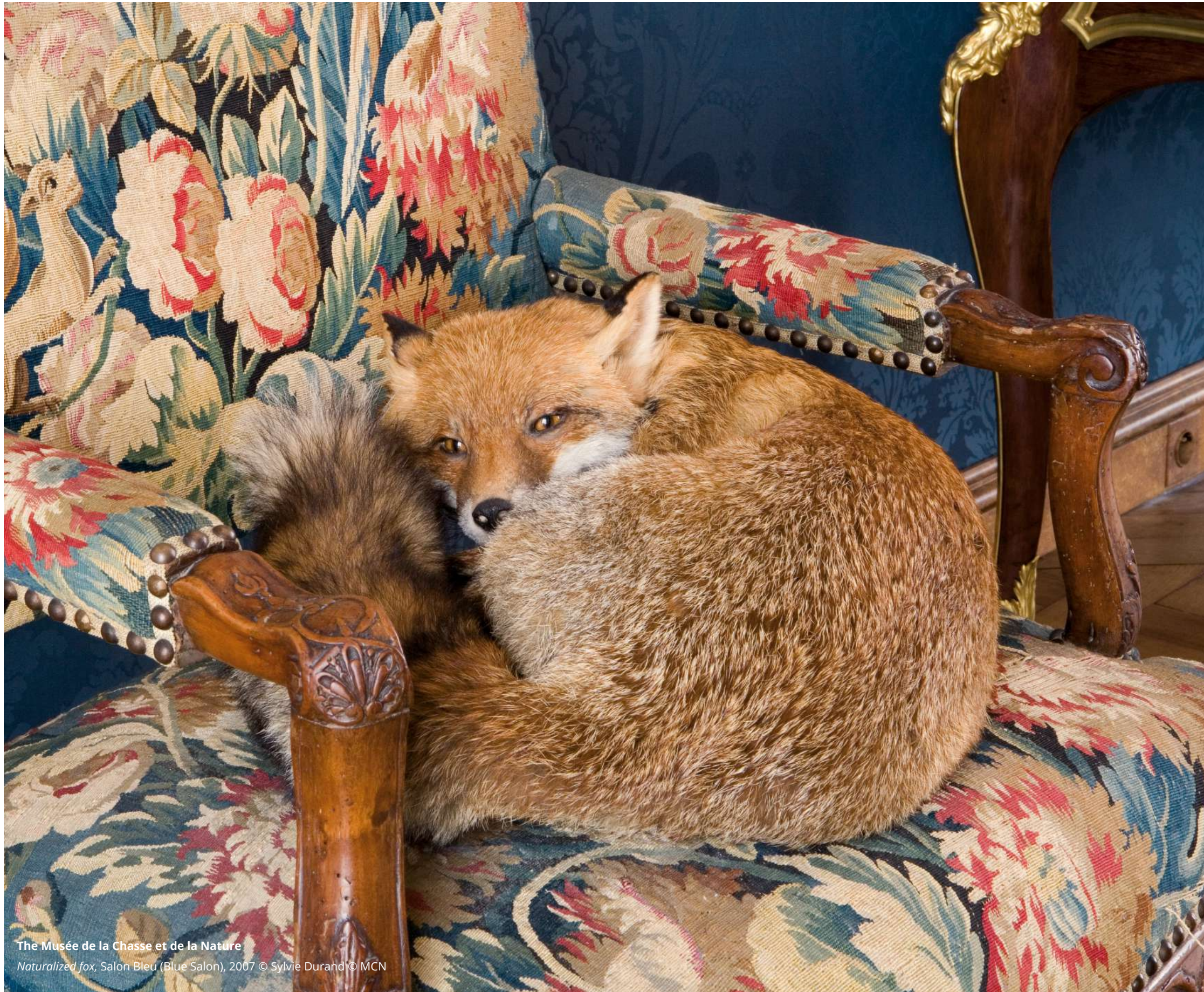
The Musée de la Chasse et de la Nature Naturalized fox, Salon Bleu (Blue Salon), 2007