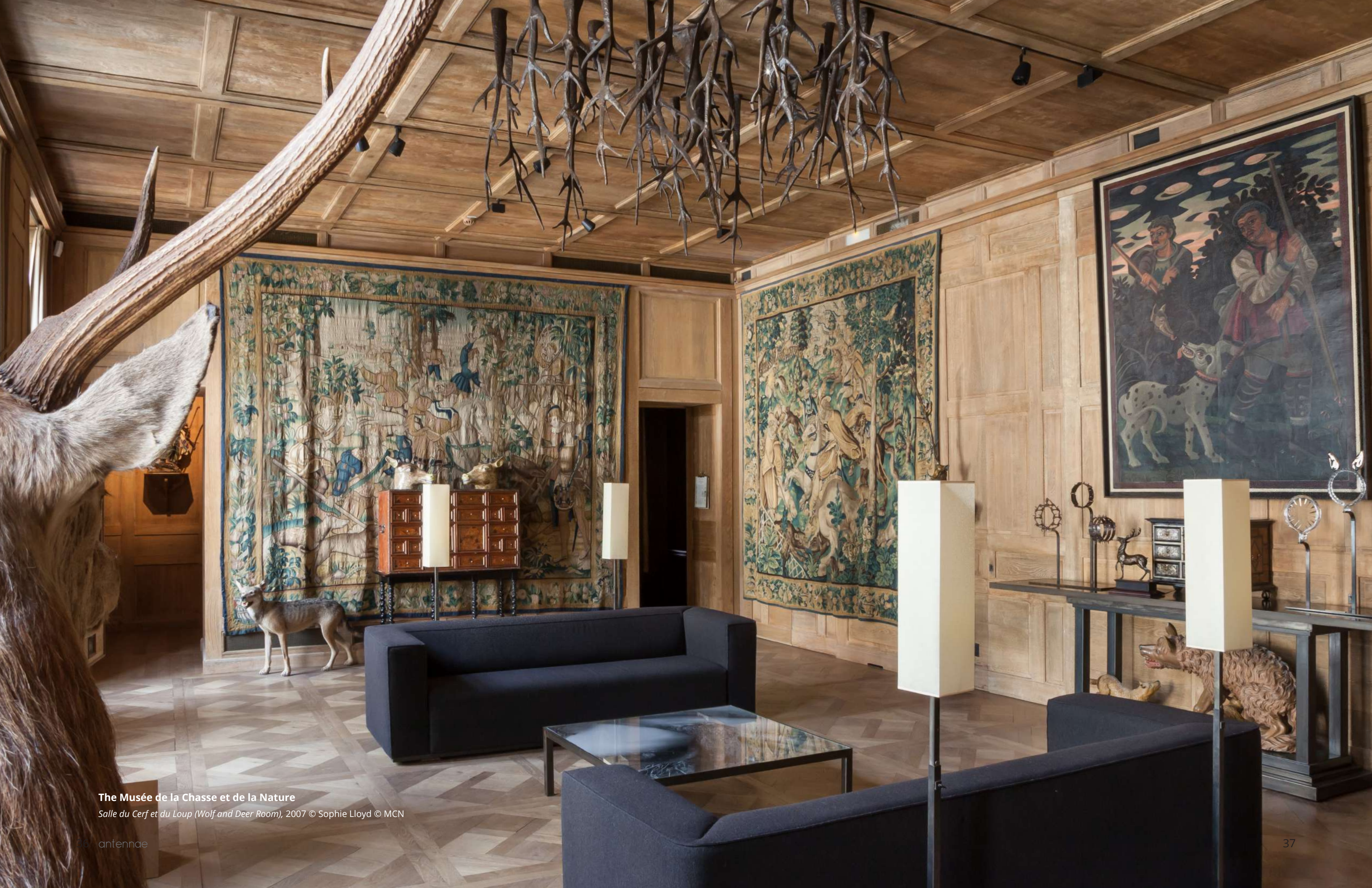
The Musée de la Chasse et de la Nature Salle du Cerf et du Loup (Wolf and Deer Room), 2007