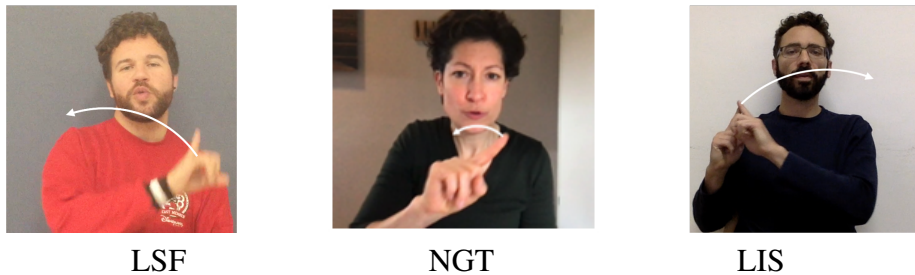
Figure 2 The sign UNTIL in LSF, NGT and LIS.

Still images of the signs UNTIL in the three sign languages are given in Figure 2. All signs have an iconic component represented by the movement of the hand. This could be either as prominent as the more or less arc-shaped side-to-side movement in LSF and LIS or more local like the wrist rotation in NGT. In either case, the trajectory of the hand somehow iconically references the temporal interval of the UNTIL phrase. Notice that the length, the speed and the intensity of the movement can be iconically modulated to incorporate shorter or longer time intervals. The position of the hand at the end of the sign locates the temporal boundary that is lexically specified by the UNTIL phrase on an abstract time-line that extends side-to-side in the signing space.