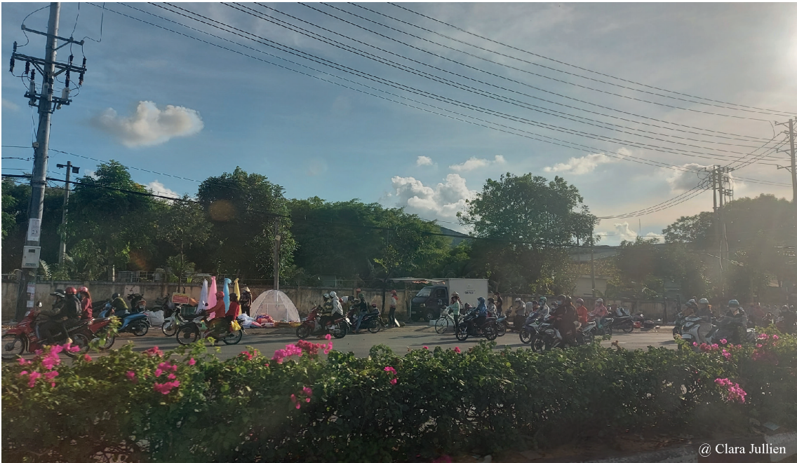
[ Figure 2/7.2 ] Migrant workers leaving Giao Long industrial park in Chau Thanh district at dusk and commuting back to their hometown in Binh Dai district, on the main road connecting the two districts through An Hoa bridge.

Another alternative is to leave any employment sector that relies directly or indirectly on environmental conditions. Locally, within Binh Dai district, the conversions are focused mostly on small-scale entrepreneurship in the case of households who have a small financial capital or access to land and buildings, or on the construction sector. The growing construction sector in rural areas generates a local job market, but offers irregular working schedules and incomes, as well as very tough working conditions. It is of course inaccessible to older people. Overall, the main growing alternative to farming is to become