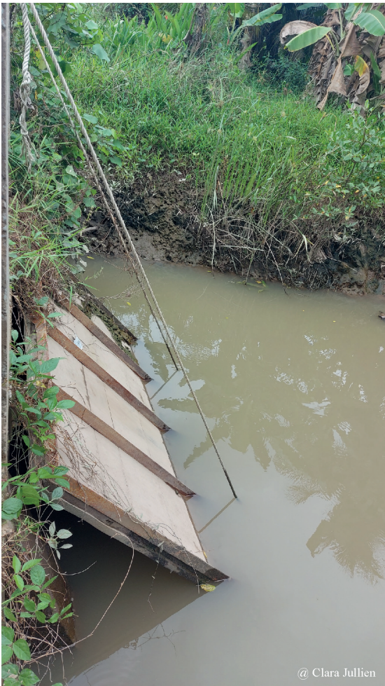
[ Figure 2/7.3 ] Failing public sluiceway in Long Dinh commune, Binh Dai district, Ben Tre province